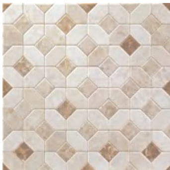
CAPRICE MÁRMOL CREMA 45 x 45 • 17,7" x 17,7" PR0503