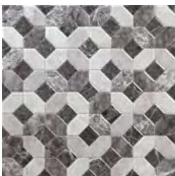
CAPRICE MÁRMOL GRIS 45 x 45 • 17,7" x 17,7" PR0503