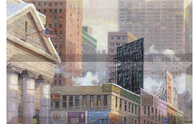
COMPOSICION FIFTH AVENUE 03 20X30 P47