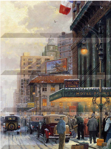
COMPOSICION FIFTH AVENUE 40X30 P94