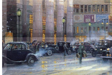
COMPOSICION FIFTH AVENUE 02 20X30 P47