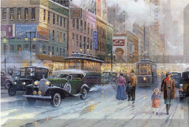
COMPOSICION FIFTH AVENUE 01 20X30 P47