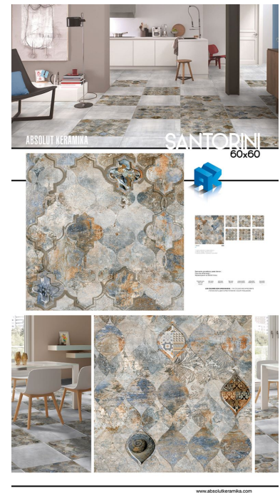
PT SANTORINI 60X60 (1925X1005)