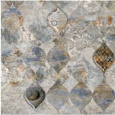
SANTORINI 60X60 B30