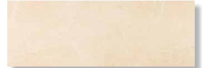
KALI CREMA 31,6x90x0,9cm P3470466 / 100095619 G261 Butech recomienda junta / Butech recommends joint: Colorstuk Rapid n Beige B22502016 / 100004308