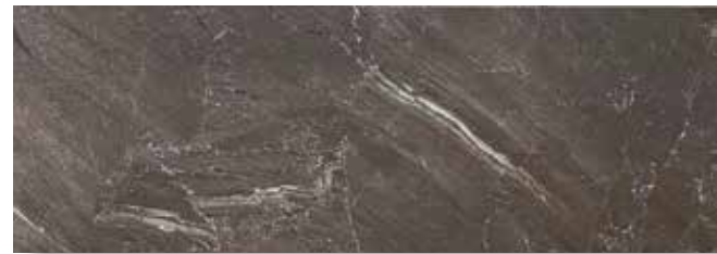
RECIFE ANTRACITA 31,6x90x0,9cm P3470438 / 100093298 G261 Butech recomienda junta / Butech recommends joint: Colorstuk Rapid n Antracita B22502005 / 100004298