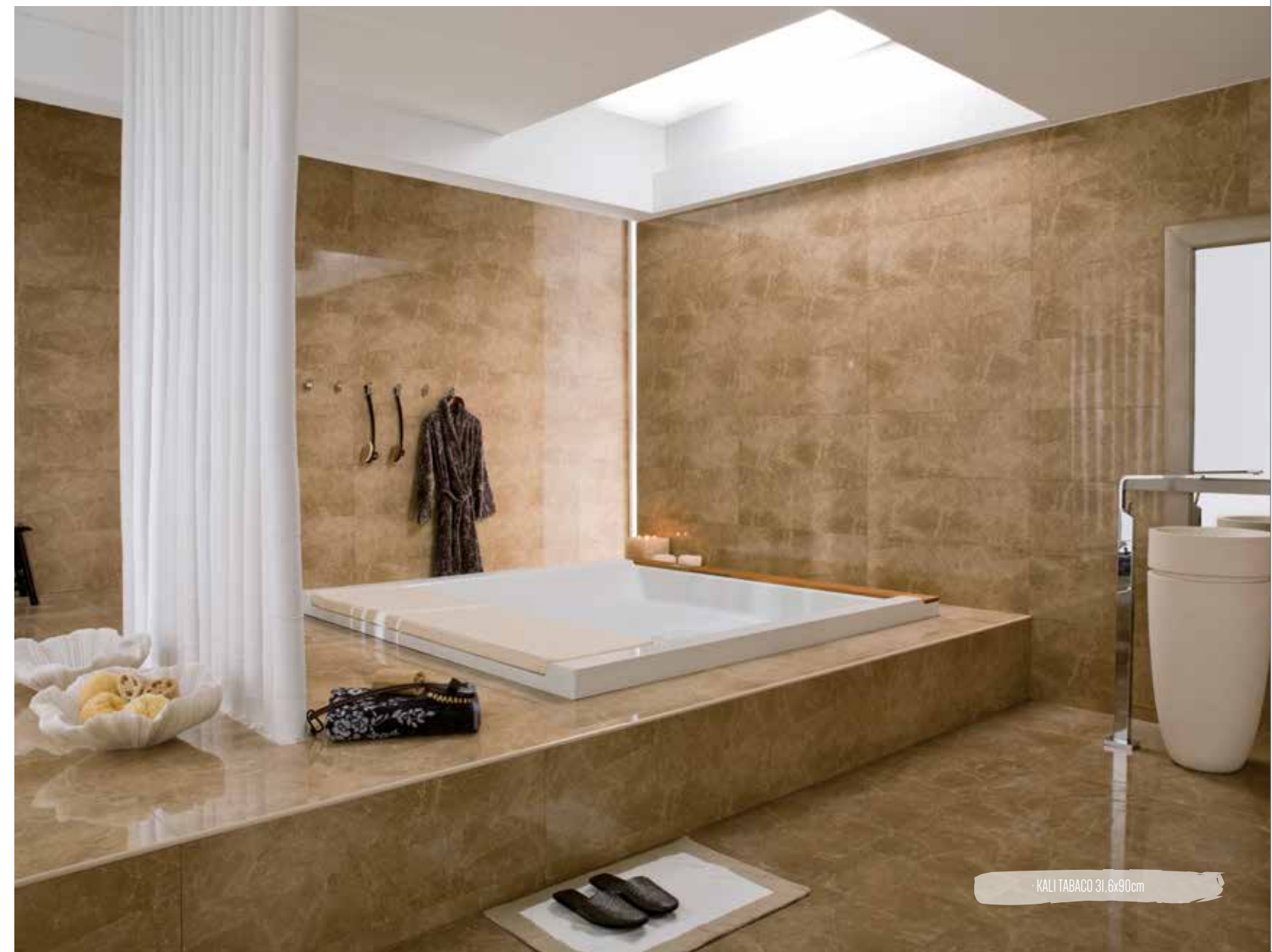
KALI TABACO 31,6x90cm

PAVIMENTO COMBINABLE: SERIE KALI 43,5x43,5cm - PAG.187 FLOOR TILES COMBINATIONS: KALI SERIES 43,5x43,5cm - PAG.187