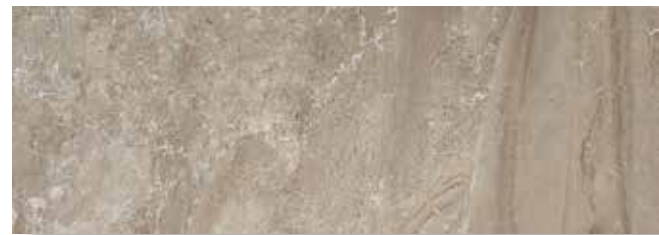
RECIFE GRIS 31,6x90x0,9cm P3470439 / 100093300 G261 Butech recomienda junta / Butech recommends joint: Colorstuk Rapid n Manhattan B22502002 / 100004295