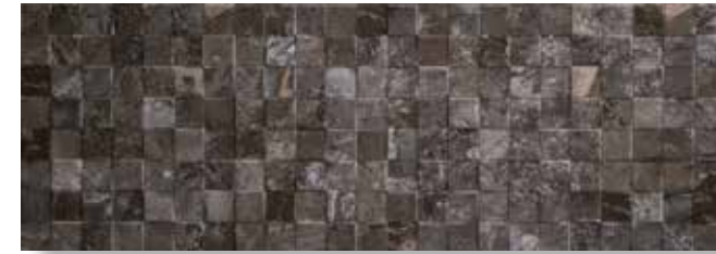
MOSAICO RECIFE ANTRACITA 31,6x90x0,95cm P3470518 / 100096427 G271 Butech recomienda junta / Butech recommends joint: Colorstuk Rapid n Antracita B22502005 / 100004298