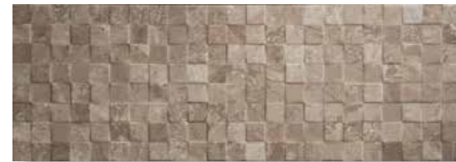
MOSAICO RECIFE GRIS 31,6x90x0,95cm P3470517 / 100096428 G271 Butech recomienda junta / Butech recommends joint: Colorstuk Rapid n Manhattan B22502002 / 100004295