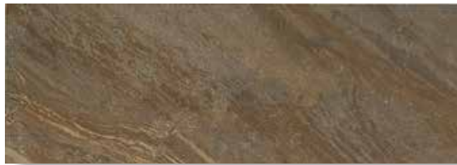
RECIFE PULPIS 31,6x90x0,9cm P3470437 / 100093302 G261 Butech recomienda junta / Butech recommends joint: Colorstuk Rapid n Tabaco B22502011 / 100004304