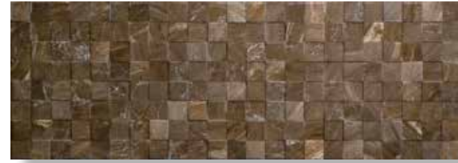
MOSAICO RECIFE PULPIS 31,6x90x0,95cm P3470516 / 100096429 G271 Butech recomienda junta / Butech recommends joint: Colorstuk Rapid n Tabaco B22502011 / 100004304