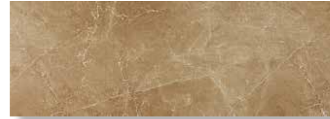
KALI TABACO 31,6x90x0,9cm P3470470 / 100095621 G261 Butech recomienda junta / Butech recommends joint: Colorstuk Rapid n Tabaco B22502011 / 100004304