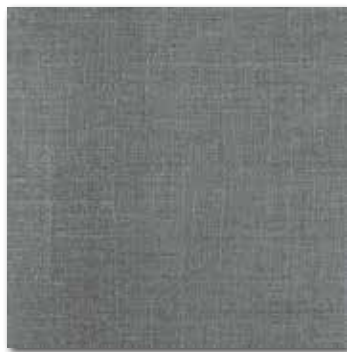
DAK44185 PEI 5 ○ 86 / m 2 mat/lesk | matt/glossy