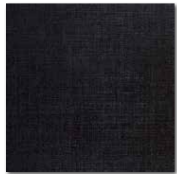
DAK44187 PEI 4 ○ 86 / m 2 mat/lesk | matt/glossy