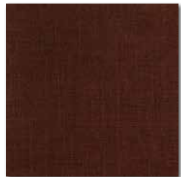
DAK44186 PEI 4 ○ 86 / m 2 mat/lesk | matt/glossy