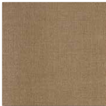
DAK44184 PEI 5 ○ 86 / m 2 mat/lesk | matt/glossy