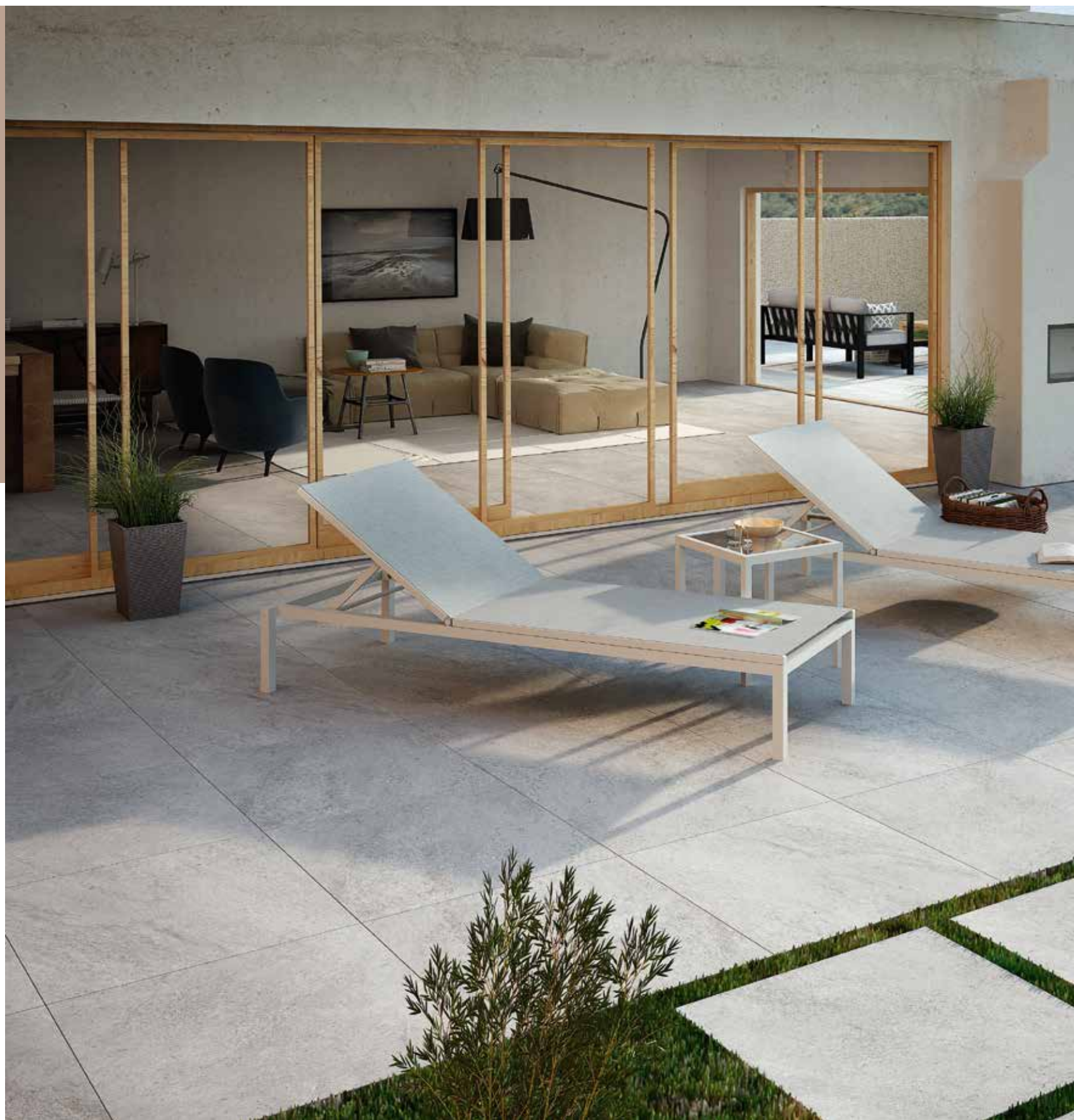
PAVIMENTO: STONE AGE GRIS 60x60 cm.