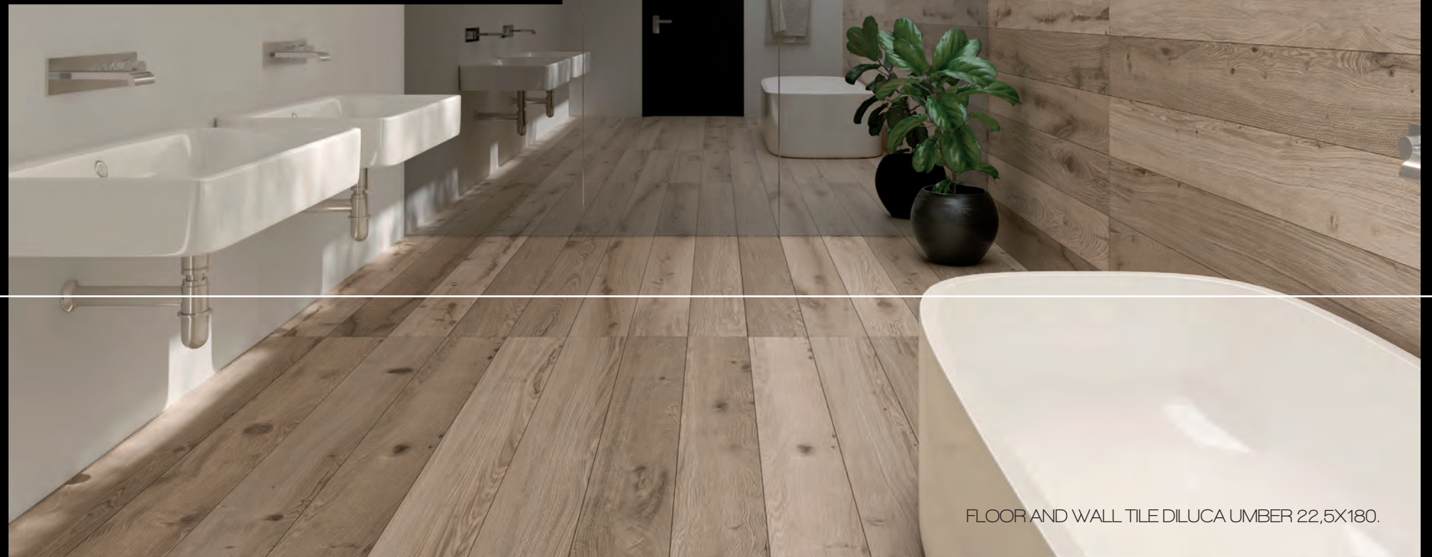
FLOOR AND WALL TILE DILUCA UMBER 22,5X180.