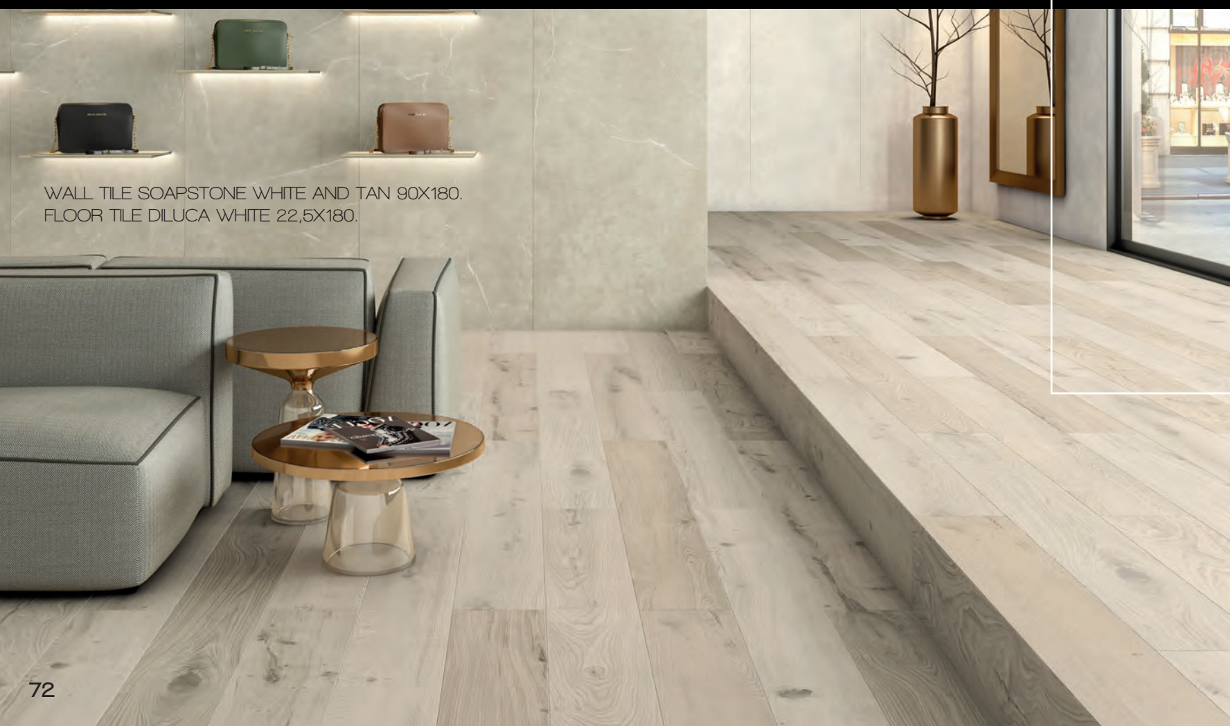
WALL TILE SOAPSTONE WHITE AND TAN 90X180. FLOOR TILE DILUCA WHITE 22,5X180.

According to a Micmaindian legend, three warrior brothers braved a series of dangers so that a magician would grant them what they wished. The first brother was tall and admired his height, the second loved the beauty of the woods and wanted to stay there forever, and the third wanted to remain healthy. The three became pine trees and, in doing so, their three wishes were granted: the first became the tallest tree in the wood, the second never left it, and the third always had lush green evergreen leaves.