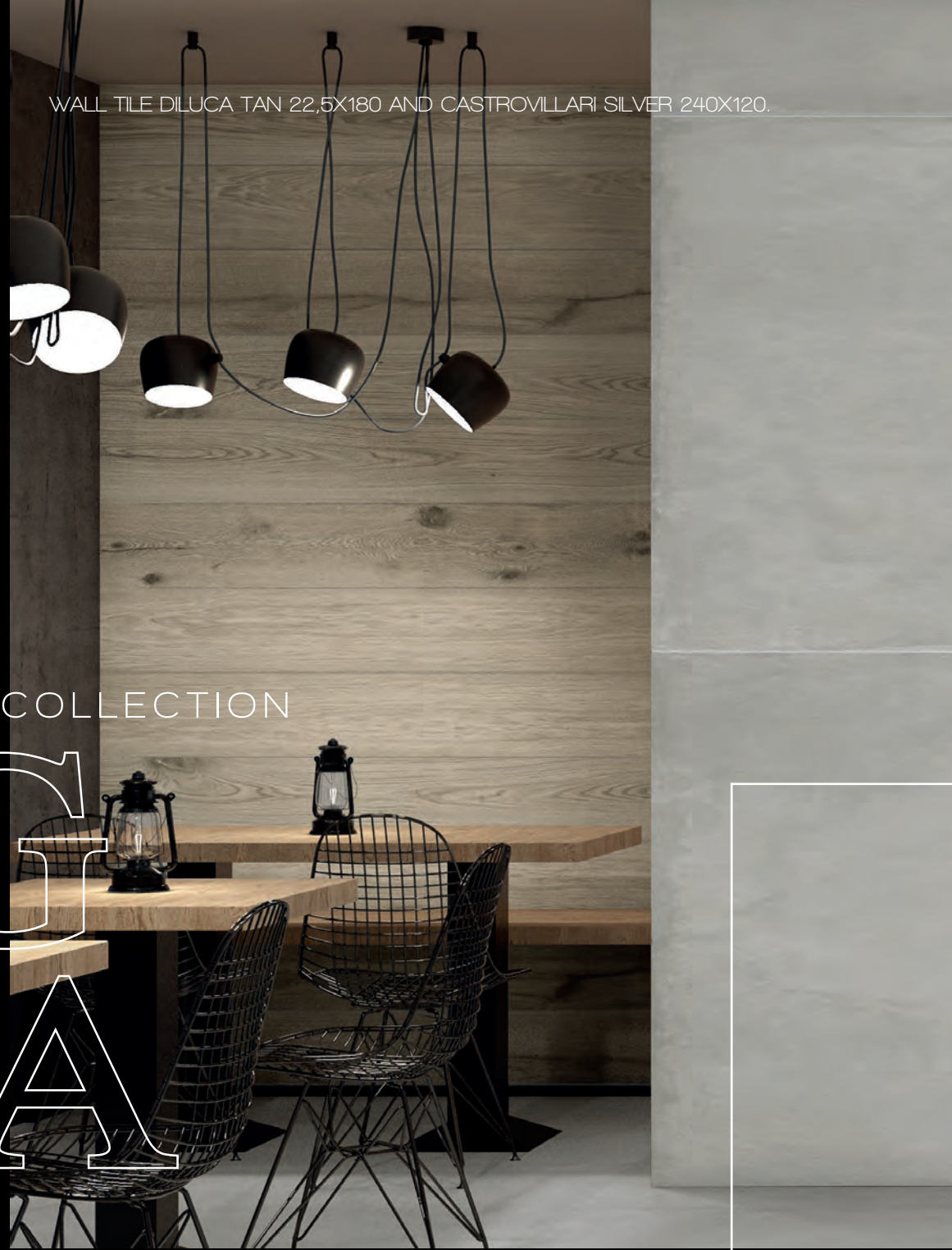
WALL TILE DILUCA TAN 22,5X180 AND CASTROVILLARI SILVER 240X120.