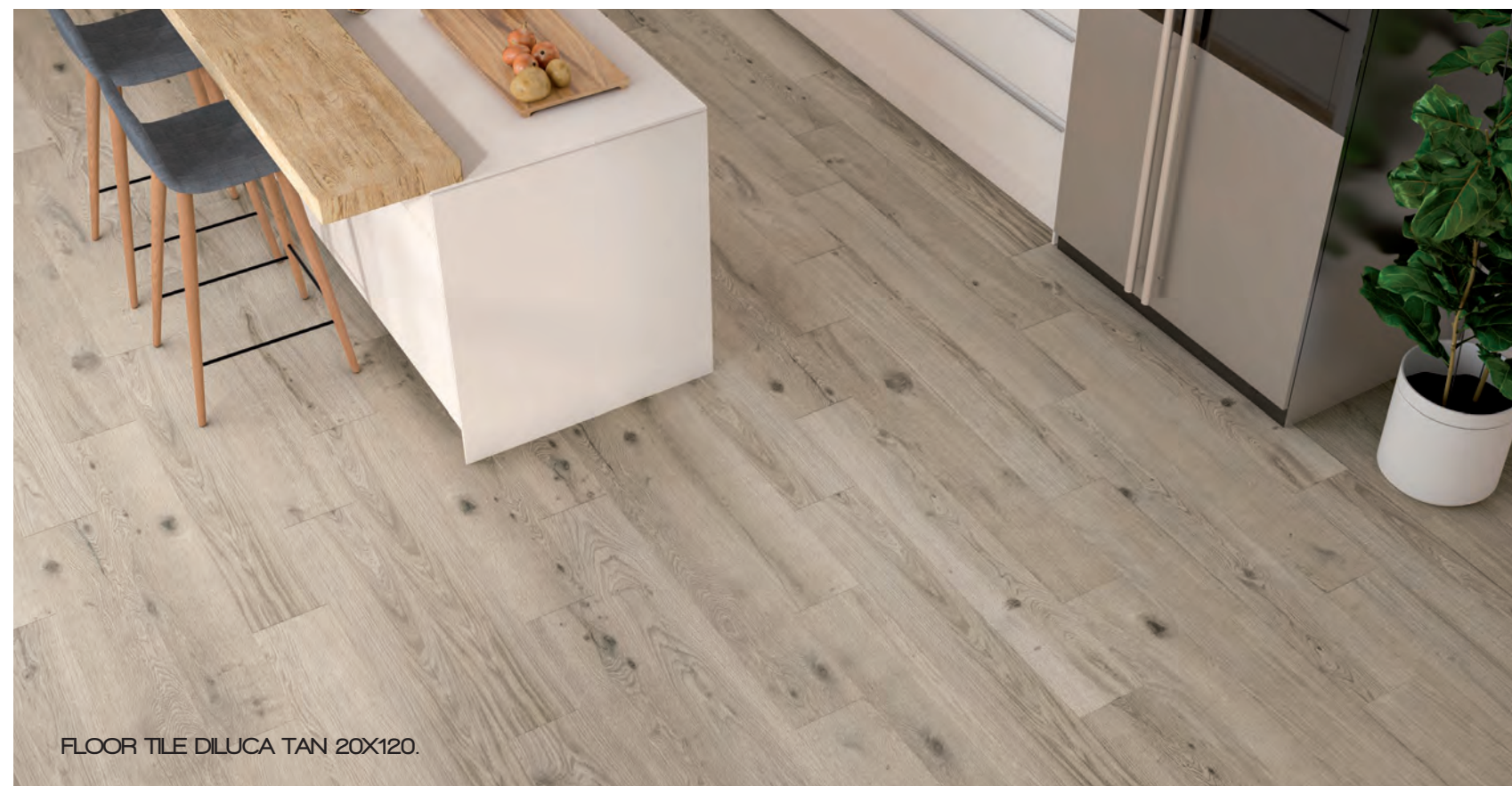
FLOOR TILE DILUCA TAN 20X120.