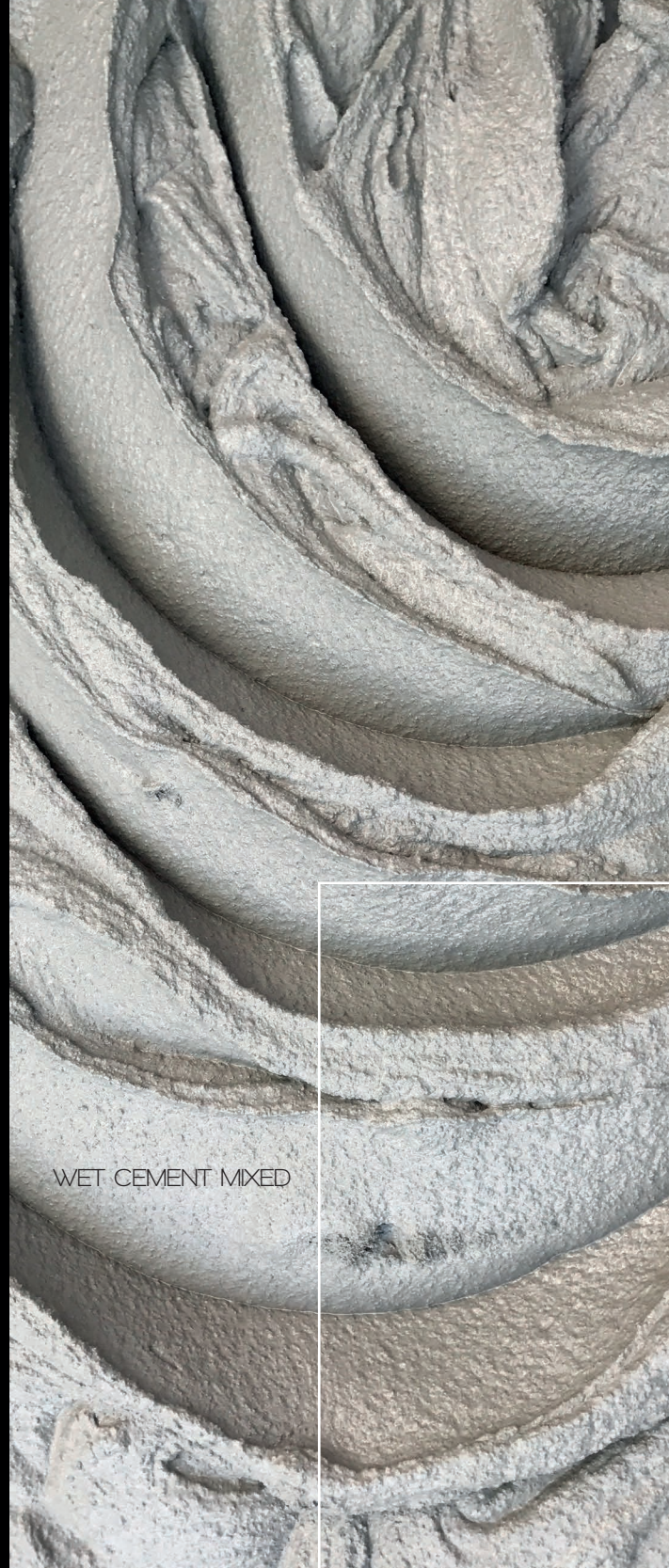
WET CEMENT MIXED

Real concrete was made in Ancient Rome, using paste and mortar, and it was capable of withstanding salt water for thousands of years. One example of Roman concrete is the famous vault of Rome's Pantheon. Stendhal described it as "the most beautiful souvenir of ancient Rome" and Michael Angelo as "built by angels and not humans". Without the presence of this miraculous material, such a marvel would never have been built.