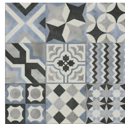
RIVET GRAY 60x60