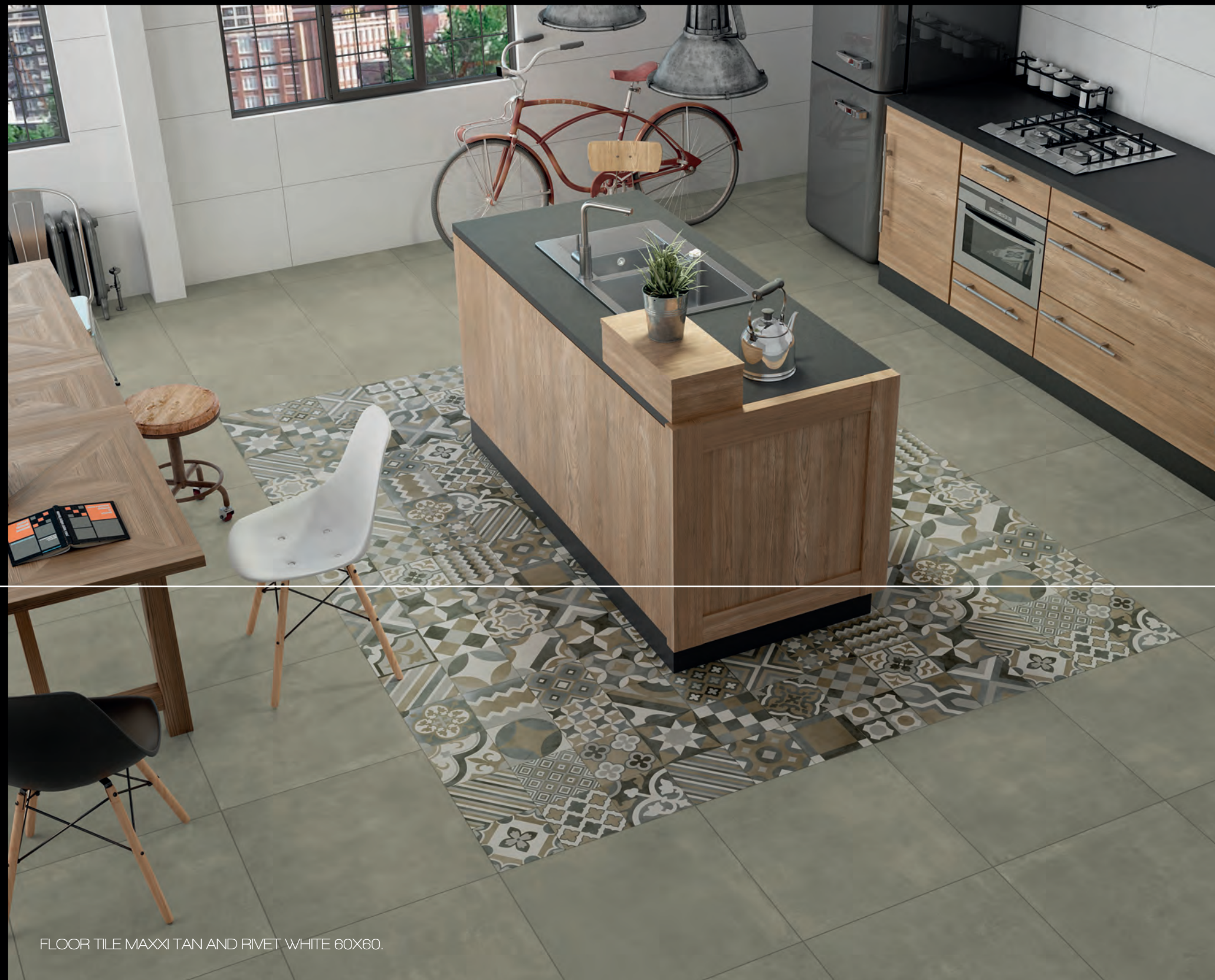
FLOOR TILE MAXXI TAN AND RIVET WHITE 60X60.