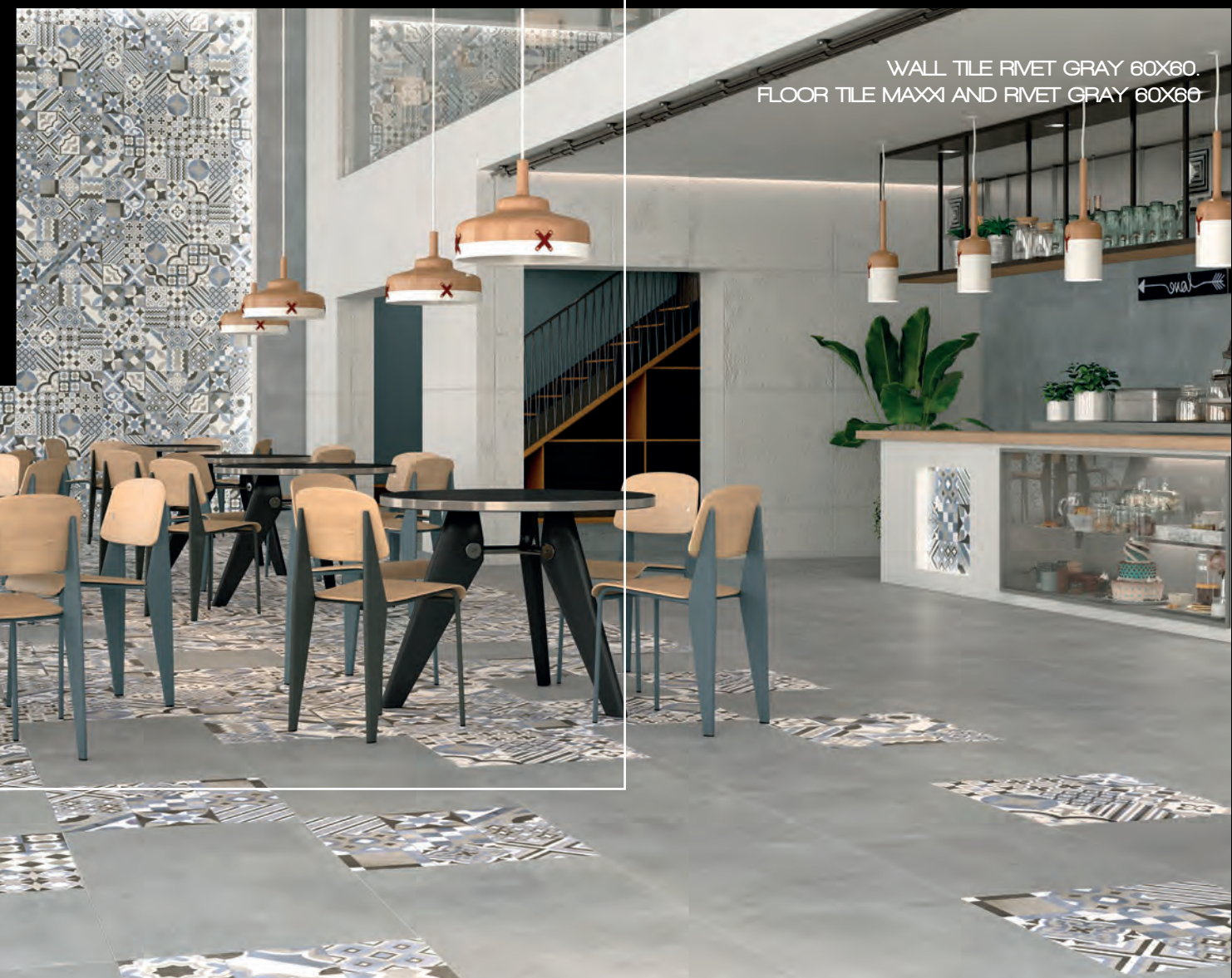
WALL TILE RIVET GRAY 60X60. FLOOR TILE MAXXI AND RIVET GRAY 60X60