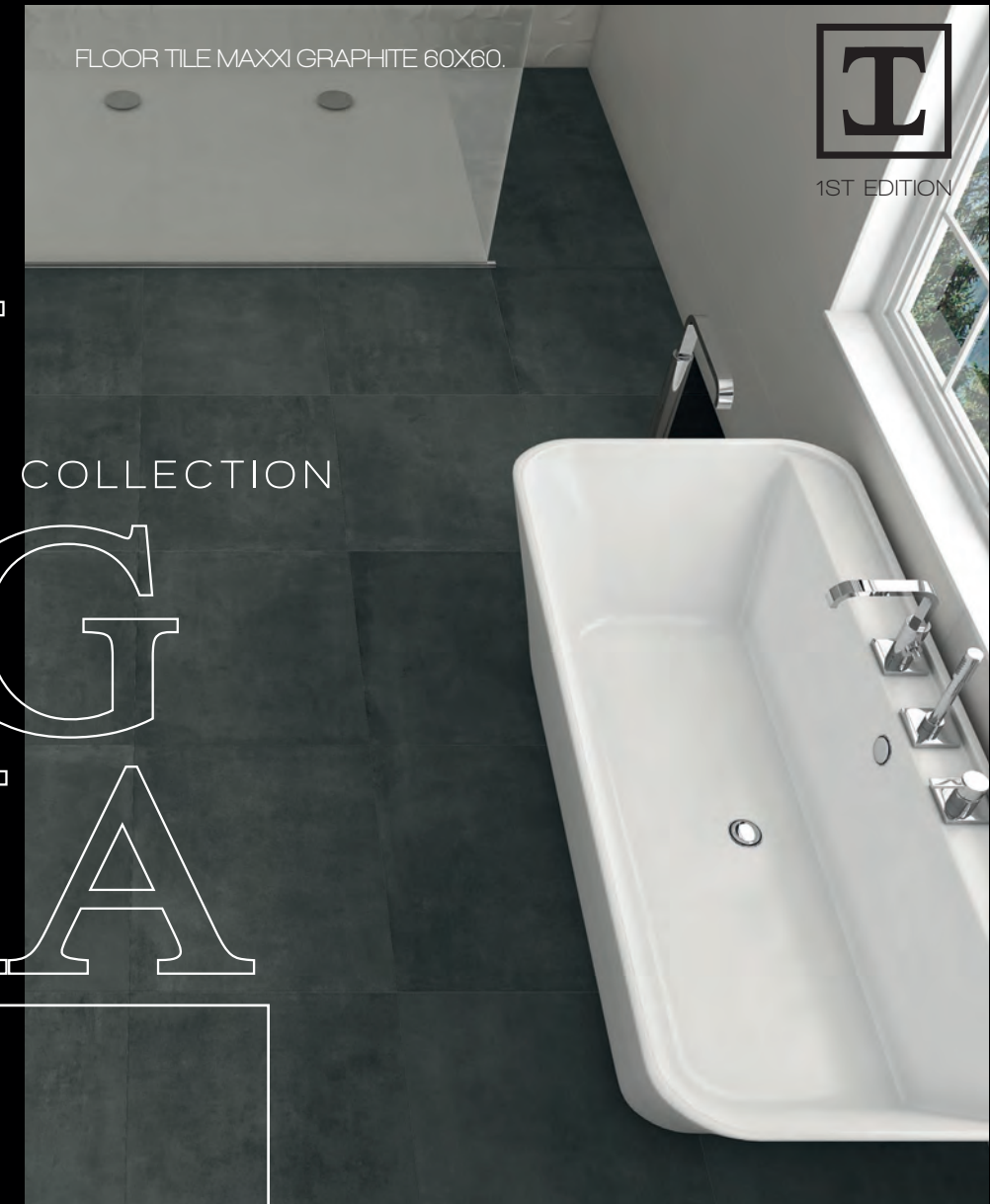
FLOOR TILE MAXXI GRAPHITE 60X60.