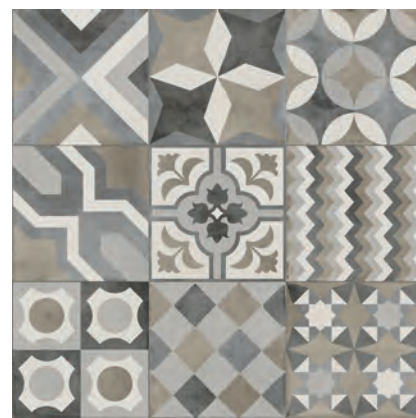
RIVET WHITE 60x60