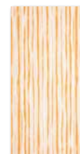
WITMB011 ○ 58 / ks lesk | glossy