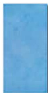
WATMB023 ○ 68 / m 2 lesk | glossy