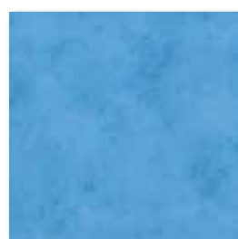
GAT3B196 PEI 3 ○ 74 / m 2 mat | matt modrá / blue / niebieska голубой / kék / azul