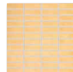
GDMAJ007 (SET) PEI 4 ○ 58 / set lesk | glossy