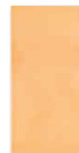
WATMB021 ○ 68 / m 2 lesk | glossy