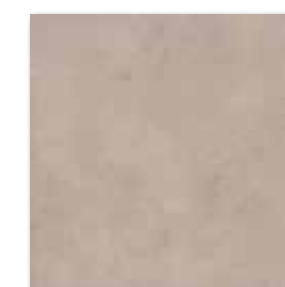
GAT3B195 PEI 3 ○ 74 / m 2 mat | matt hnědá / brown / brązowa коричневый / barna / marrón