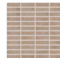
GDMAJ008 (SET) PEI 3 ○ 58 / set lesk | glossy