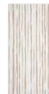
WITMB012 ○ 58 / ks lesk | glossy