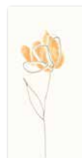
WITMB009 ○ 58 / ks lesk | glossy bilá / white / biata белый / fehér / blanco