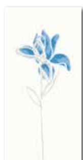
WITMB010 ○ 58 / ks lesk | glossy bilá / white / biata белый / fehér / blanco