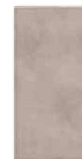
WATMB022 ○ 68 / m 2 lesk | glossy