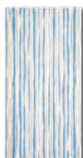
WITMB013 ○ 58 / ks lesk | glossy