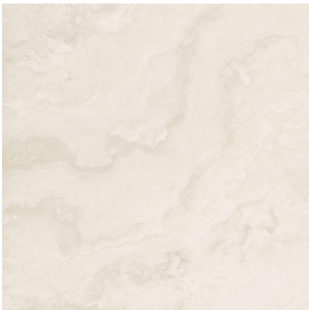
BORNEO 60X60 B27