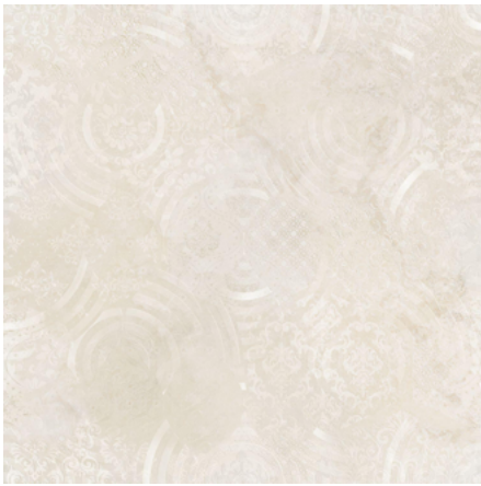
BORNEO DECOR 60X60 B30