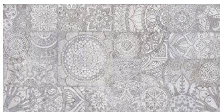
TOSCANA 29.8X60 B43