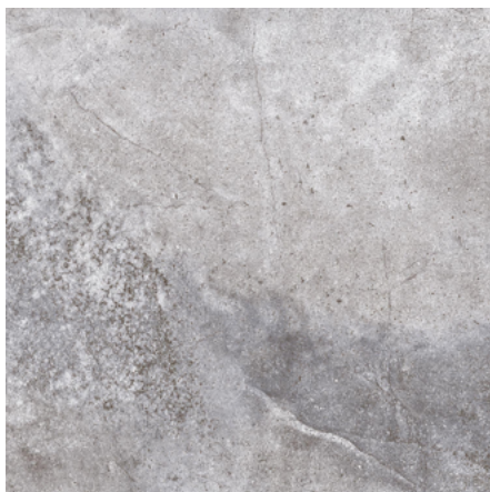
TOSCANA DARK GREY 60X60 B35