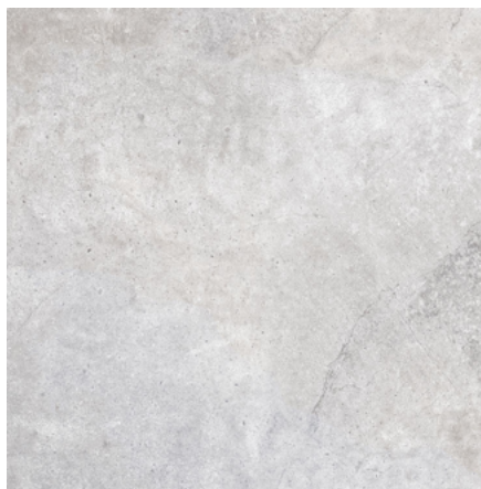
TOSCANA SILVER 60X60 B35