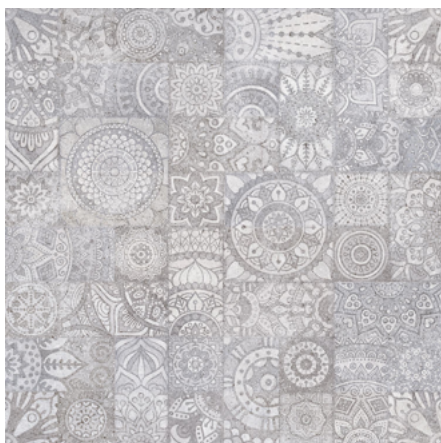
TOSCANA 60X60 B41