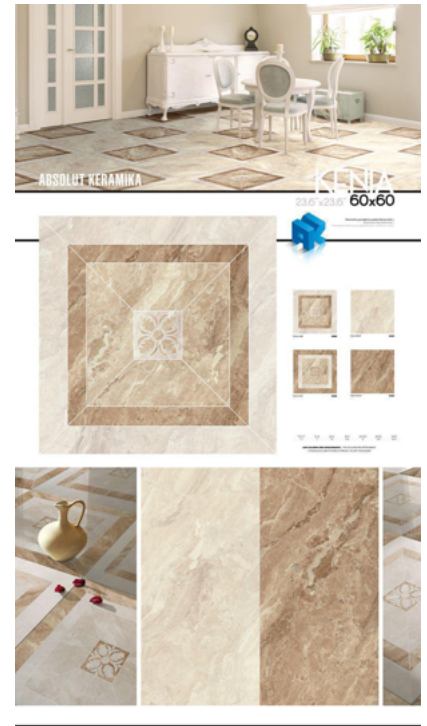
PT KENIA LIGHT 60X60 (100.5x192.5)