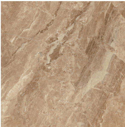
KENIA BROWN B27