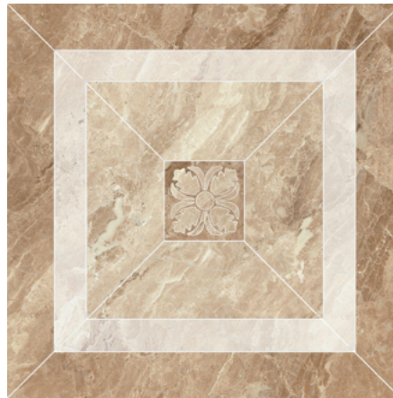
KENIA DARK B27