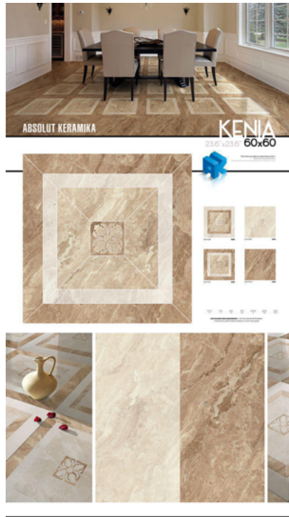
PT KENIA DARK 60X60 (100.5x192.5)