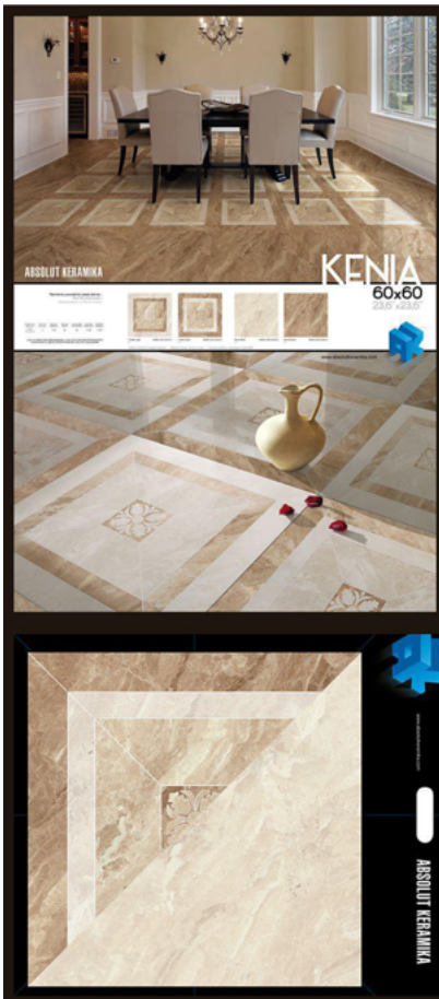
PE KENIA DARK 60X60 (80X180)