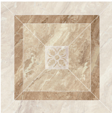
KENIA LIGHT B27