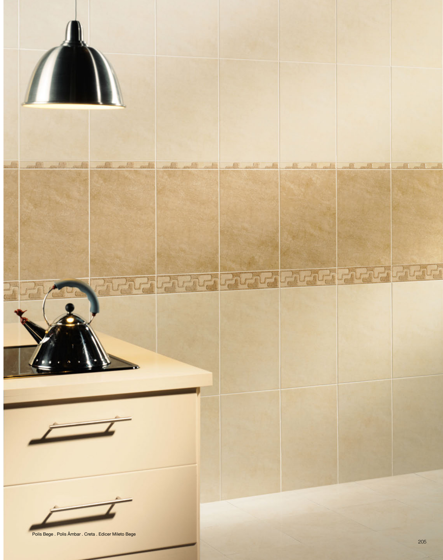
Polis Bege . Polis Ámbar . Creta . Edicer Mileto Bege