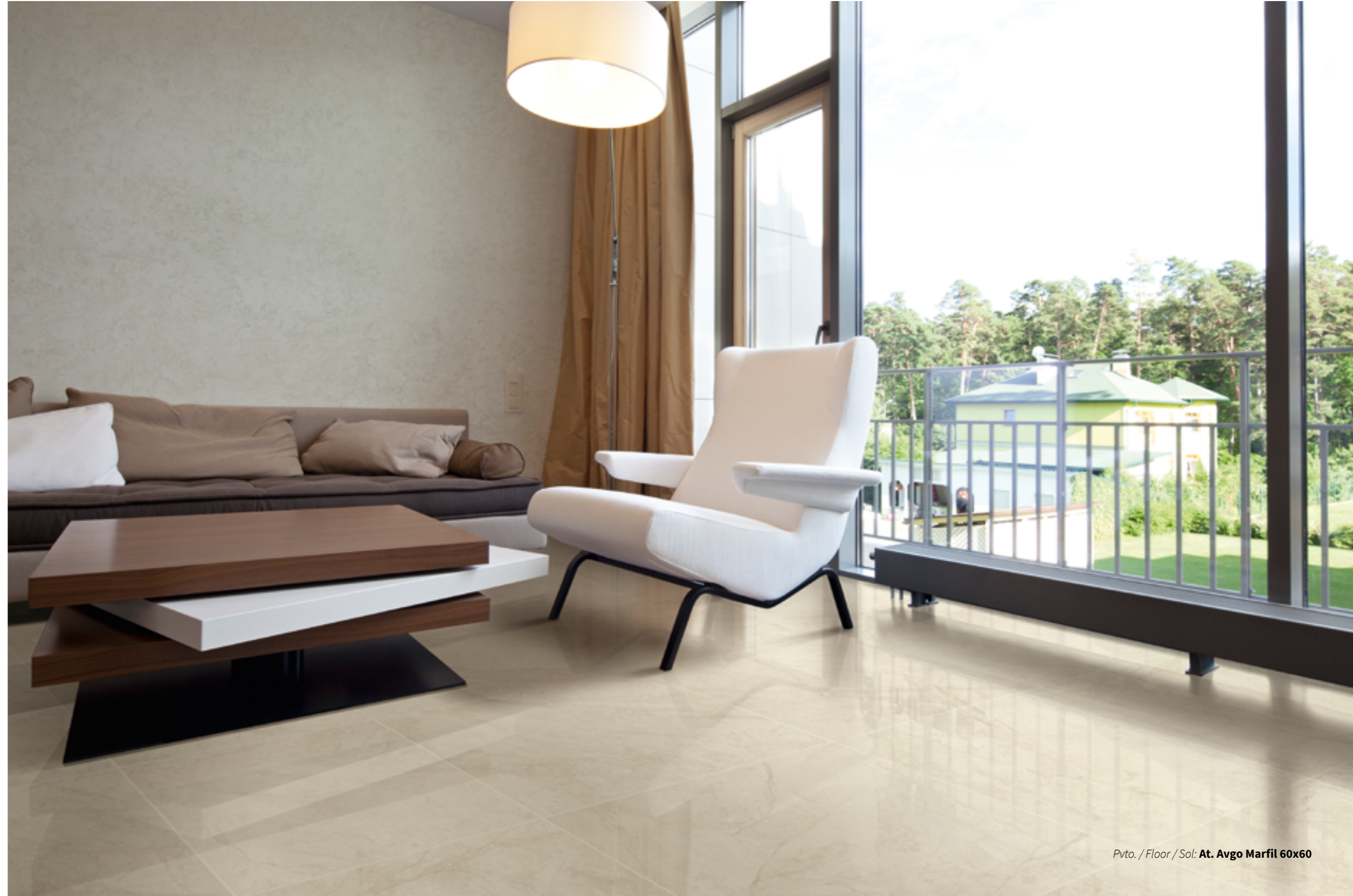
Pvto. / Floor / Sol: At. Avgo Marfil 60x60