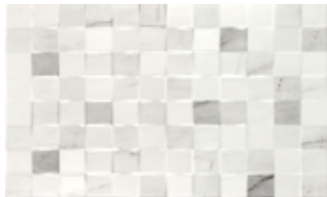
● At. Rlv. Chipre 33,3x55 M09 002.870.0001.04080