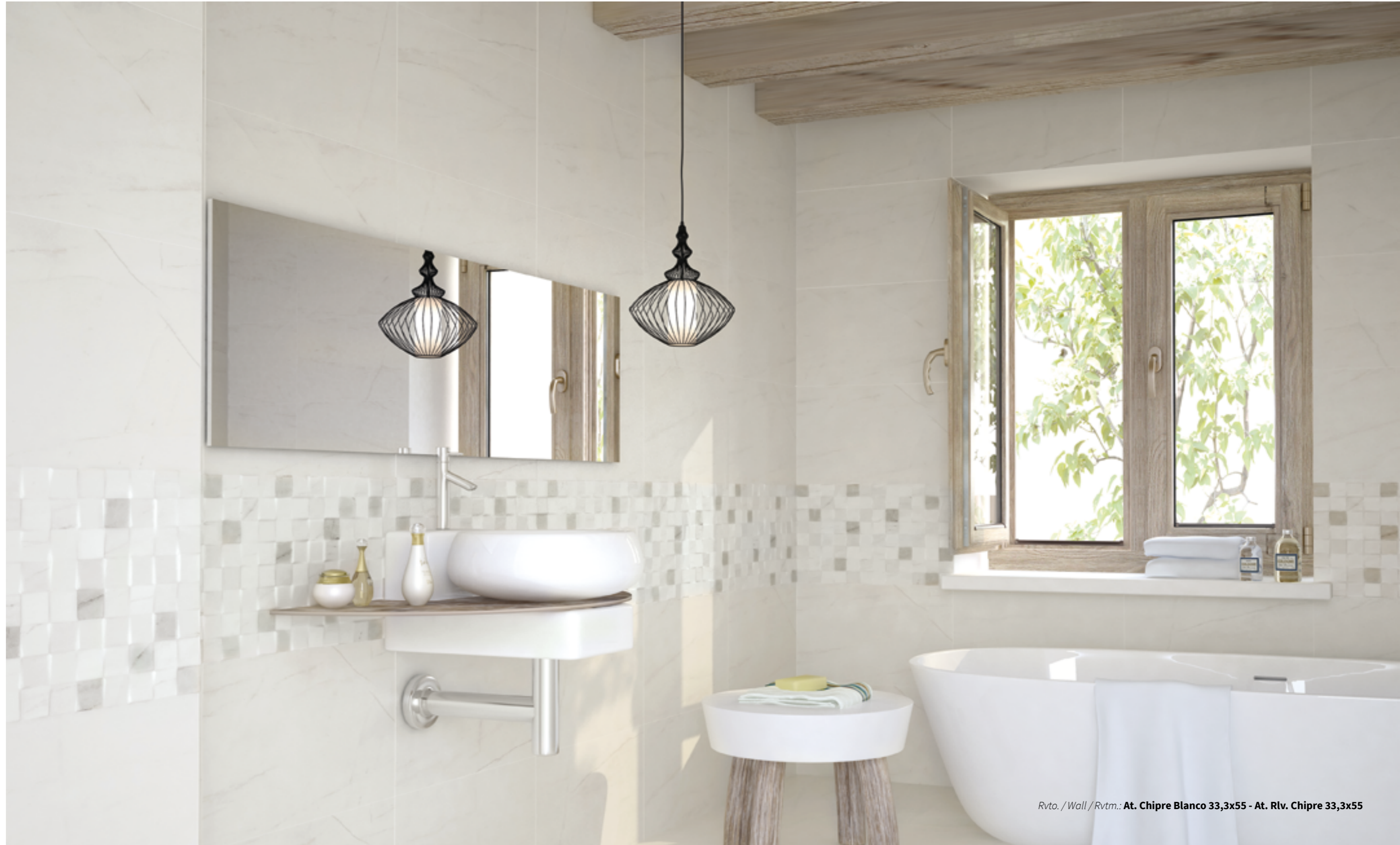
Rvto. / Wall / Rvtn.: At. Chipre Blanco 33,3x55 - At. Rlv. Chipre 33,3x55