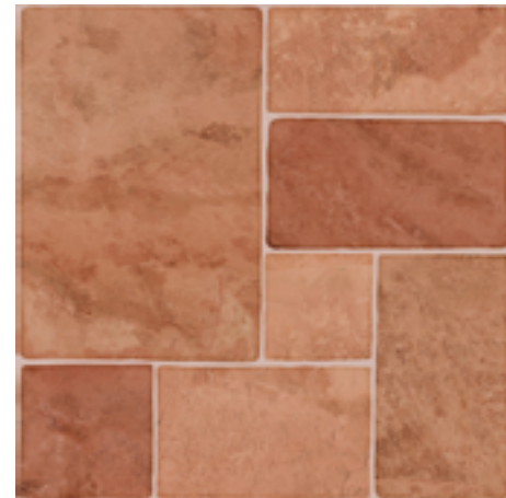
● At. Museum Coto 45x45 M06 001.302.0046.06168