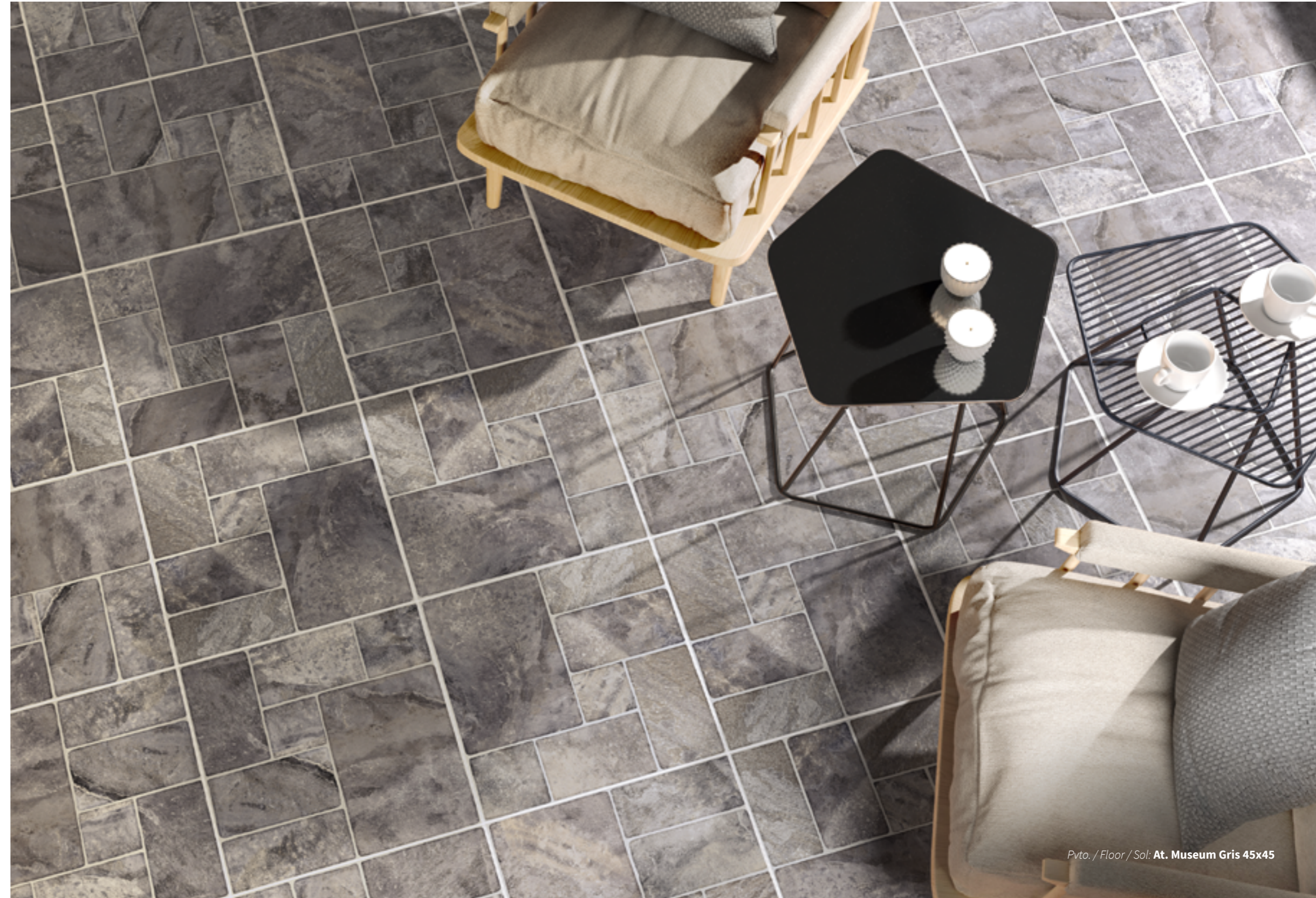
Pvto. / Floor / Sol: At. Museum Gris 45x45