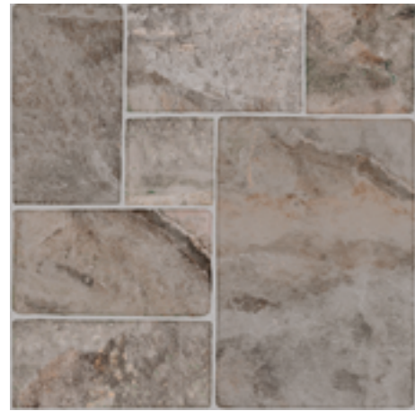
● At. Museum Gris 45x45 M06 001.302.0002.06168