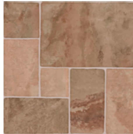
● At. Museum Marron 45x45 M06 001.302.0009.06168