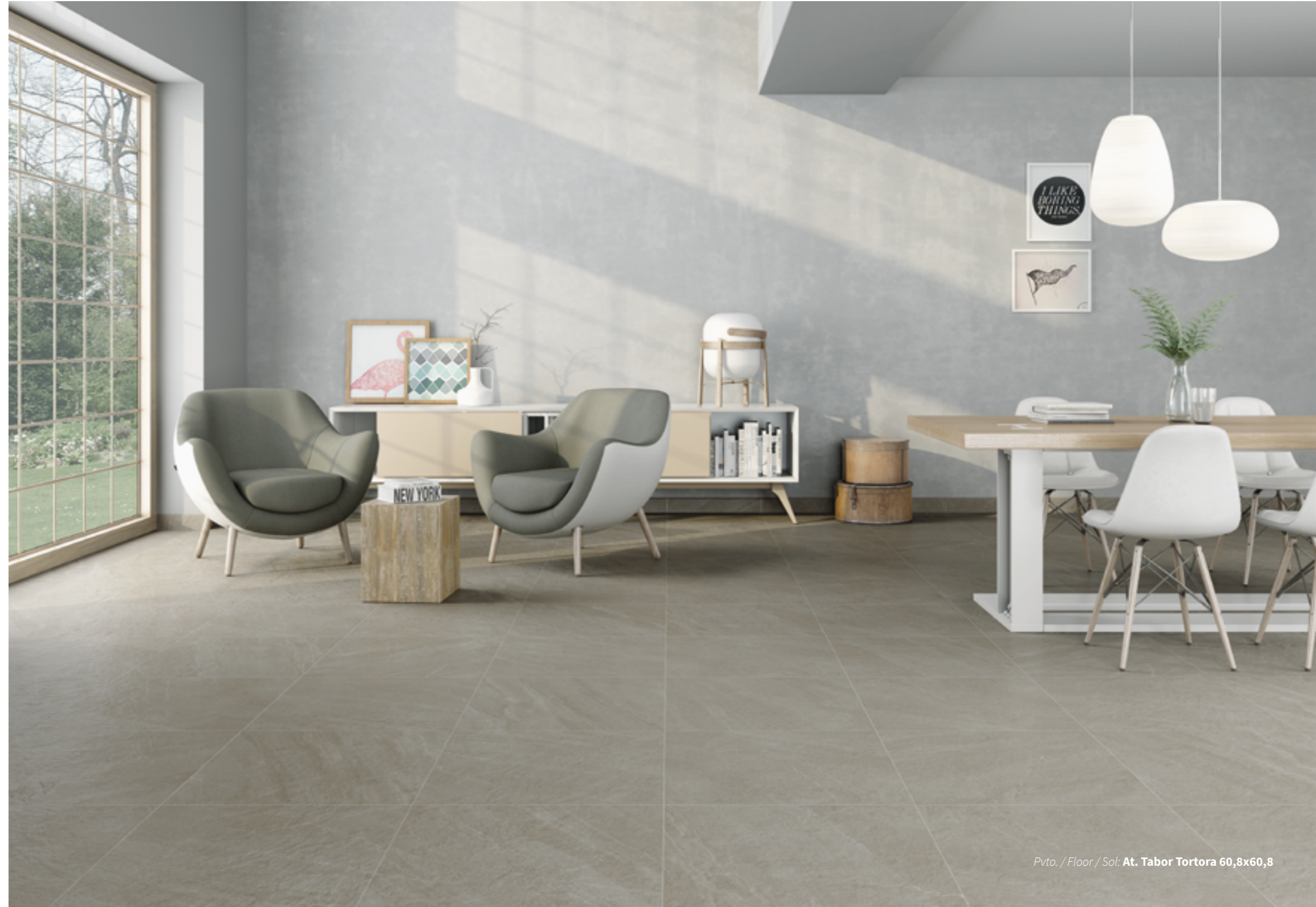
Pvto. / Floor / Sol: At. Tabor Tortora 60,8x60,8