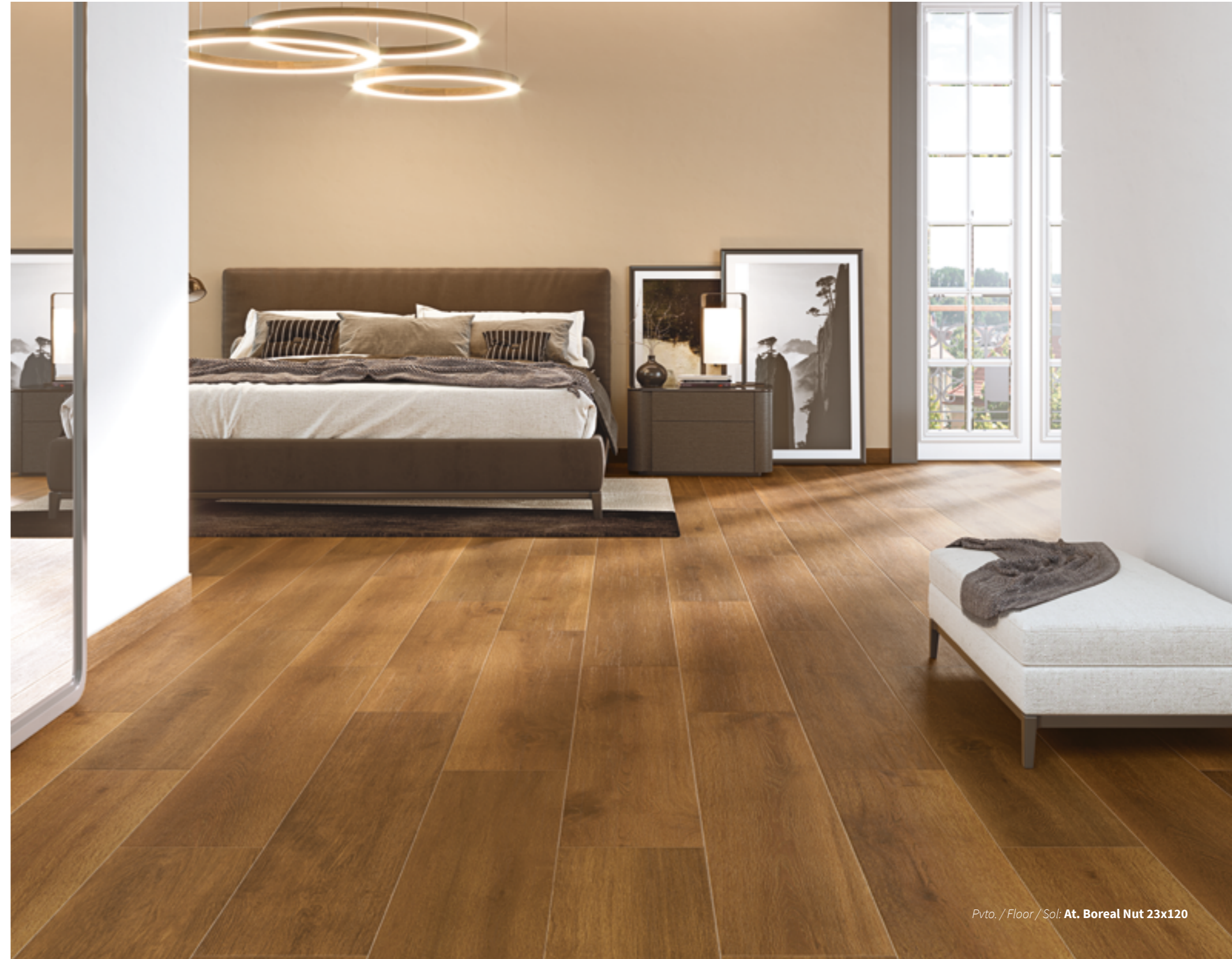
Pvto. / Floor / Sol: At. Boreal Nut 23x120

● At. Boreal Nut 23x120 M26 015.535.0310.06420