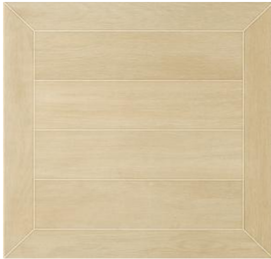
507982/AT. BOREAL HAYA/608x608x10