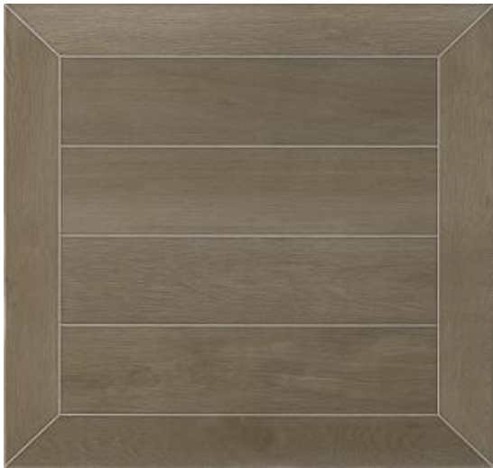
512295/AT. BOREAL TAUPE/608x608x10