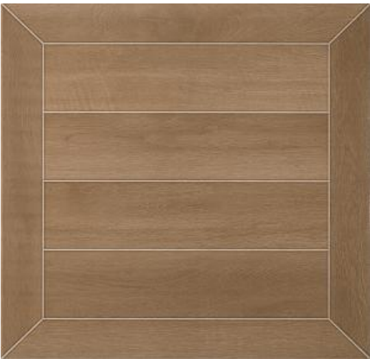
507981/AT. BOREAL ROBLE/608x608x10