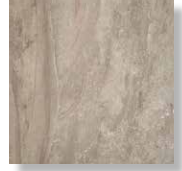
RECIFE GRIS G-R 43,5x43,5x1cm P1459084 / 100093301 G331 Butech recomienda junta / Butech recommends joint: Colorstuk Rapid n Gris B22502013 / 100004305