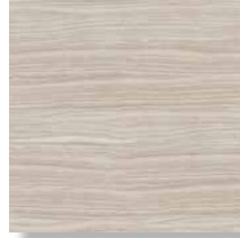
BORNEO SAGE 43,5x43,5x1cm P1459096 / 100113343 G331 Butech recomienda junta / Butech recommends joint: Colorstuk Rapid n Beige B22502016 / 100004306