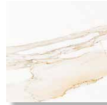
CALACATA GOLD G-R 43,5x43,5x1cm P1459092 / 100107231 G331 Butech recomienda junta / Butech recommends joint: Colorstuk Rapid n Blanco B22501001 / 100004294