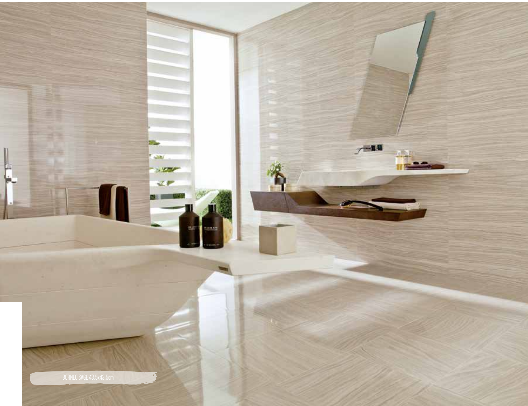
BORNEO SAGE 43,5x43,5cm

1 INTENSIDAD DE TRÁNSITO PEATONAL: TRÁNSITO MODERADO INTENSITY OF PEDESTRIAN TRANSIT: MODERATE TRANSIT