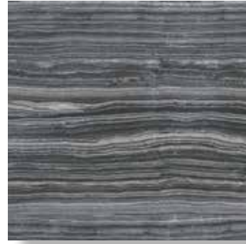
BORNEO BLUE 43,5x43,5x1cm P1459095 / 100113339 G331 Butech recomienda junta / Butech recommends joint: Colorstuk Rapid n Antracita B22502005 / 100004298