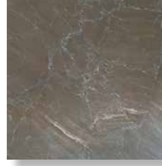
RECIFE ANTRACITA G-R 43,5x43,5x1cm P1459082 / 100093299 G331 Butech recomienda junta / Butech recommends joint: Colorstuk Rapid n Antracita B22502005 / 100004298