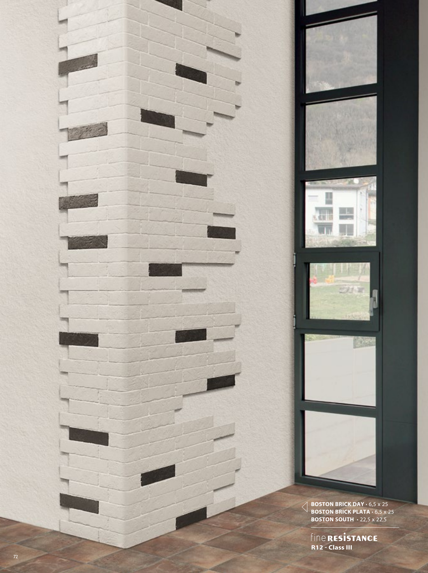
BOSTON BRICK DAY · 6,5 x 25 BOSTON BRICK PLATA · 6,5 x 25 BOSTON SOUTH · 22,5 x 22,5