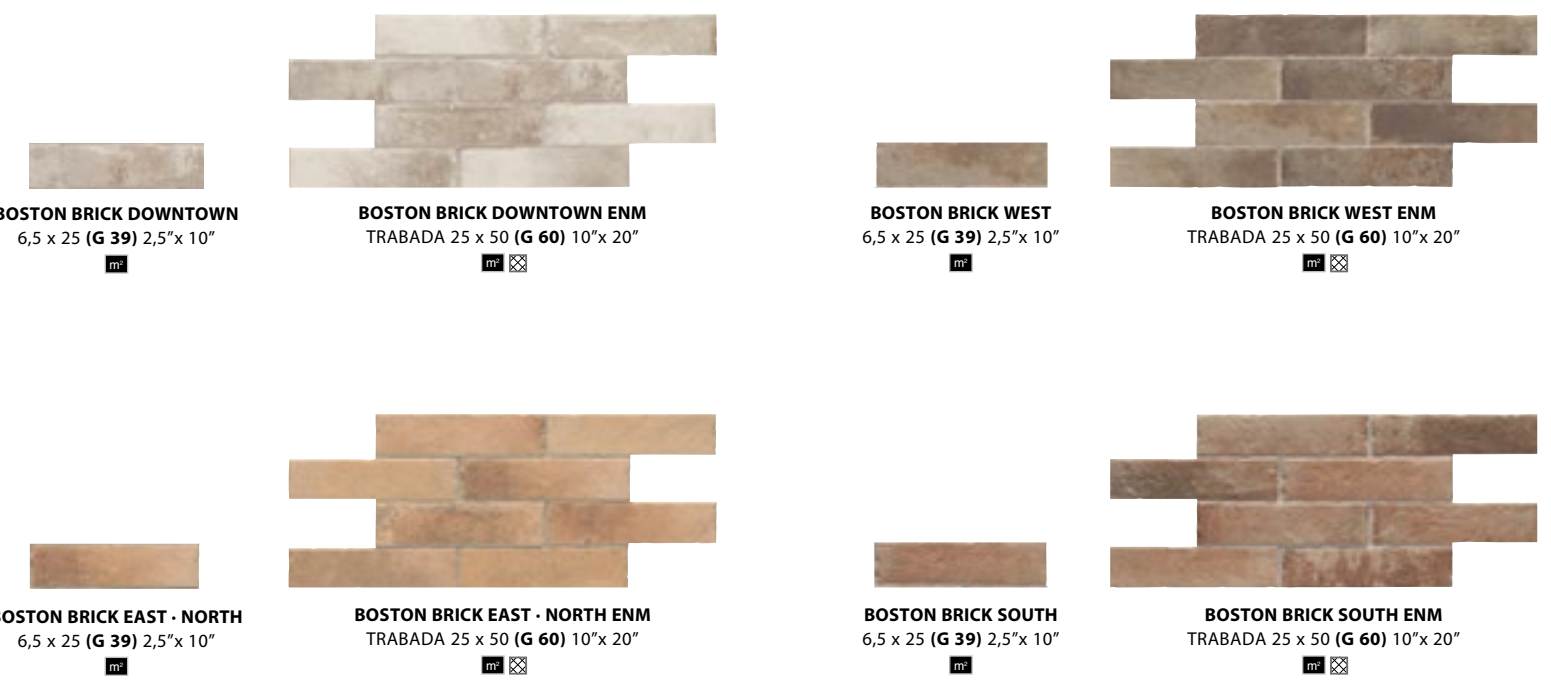
BOSTON BRICK DOWNTOWN 6,5 x 25 (G 39) 2,5" x 10"