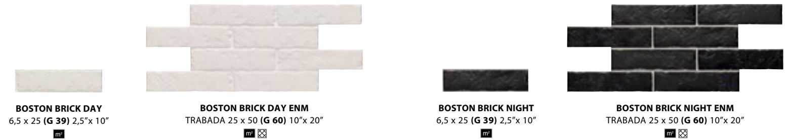
BOSTON BRICK DAY 6,5 x 25 (G 39) 2,5" x 10"