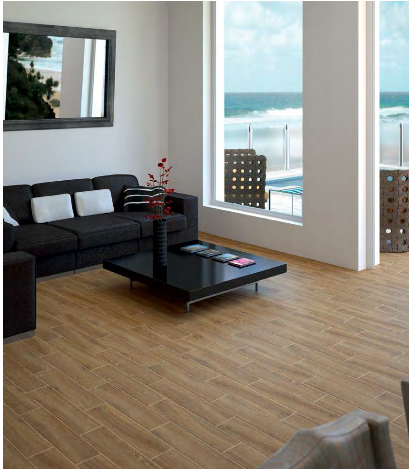
Pavimento: Canaima Secuoya 15 x 60.