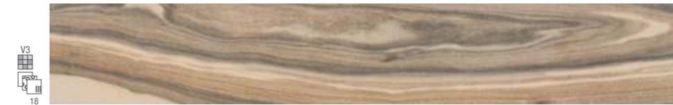
17537 TAMAY-M/19,5/EP M-3 (19,5x120)