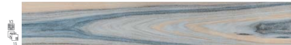
17535 TAMAY-A/19,5/EP M-3 (19,5x120)