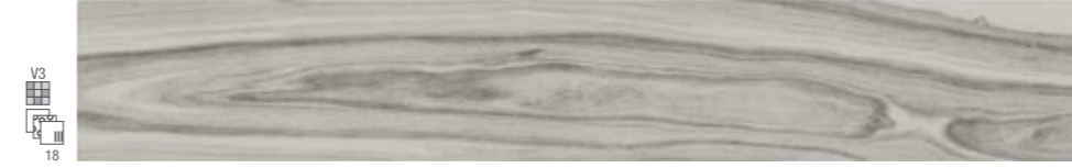
17536 TAMAY-G/19,5/EP M-3 (19,5x120)