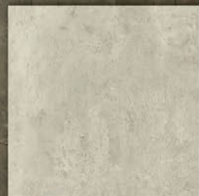
GCM 02 | BEIGE