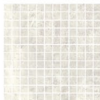
mosaic | 30cm x 30cm