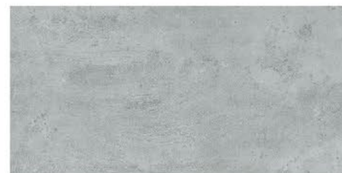
60cm x 30cm