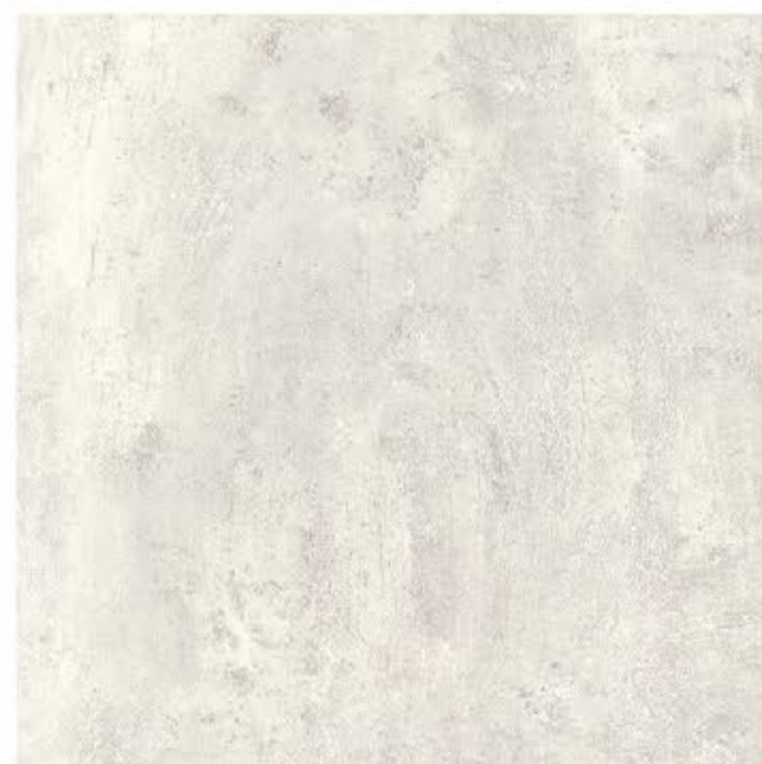
60cm x 60cm