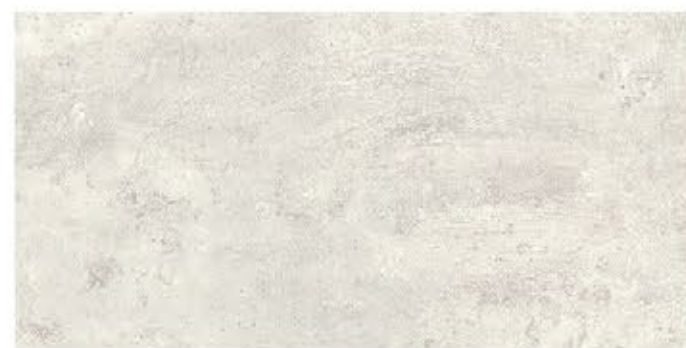
60cm x 30cm