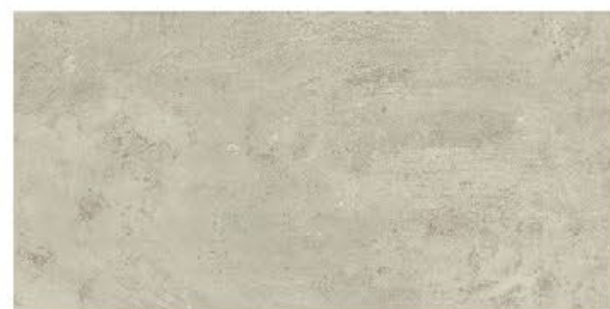
60cm x 30cm