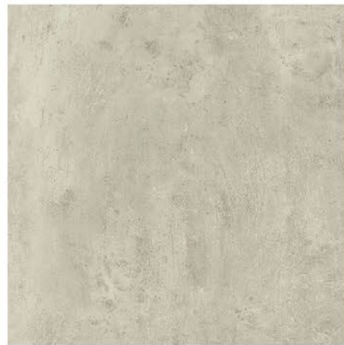
60cm x 60cm