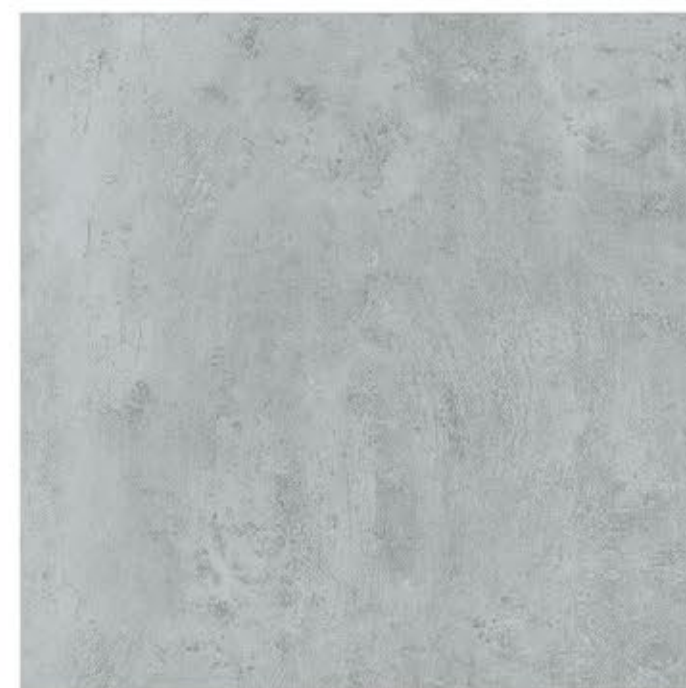
60cm x 60cm