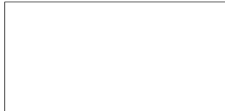
60x120 / 23.6"x47.2" PORCEL MATE