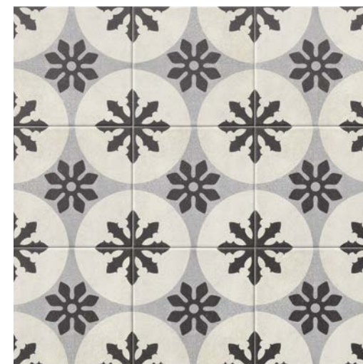
ART CONCRETE M-220 20x20 · 8"x8"