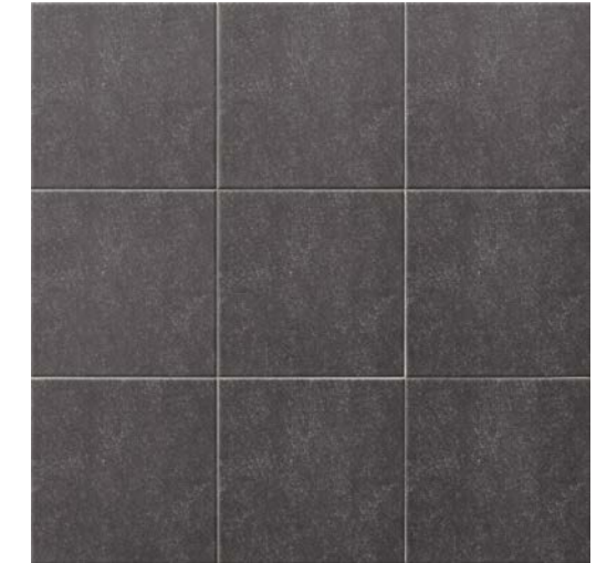
CONCRETE BLACK M-220 20x20 · 8"x8"