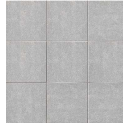
CONCRETE GREY M-220 20x20 · 8"x8"