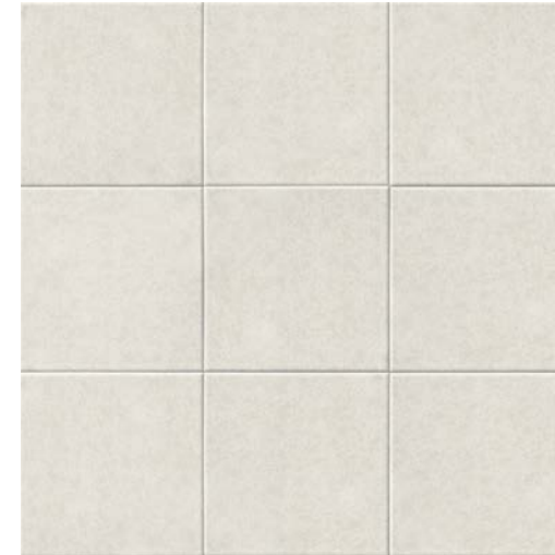
CONCRETE PEARL M-220 20x20 · 8"x8"