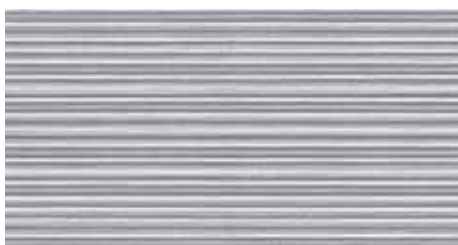
Relieve Concrete gris S 04