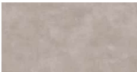
Concrete beige S 03