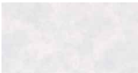
Concrete perla S 03