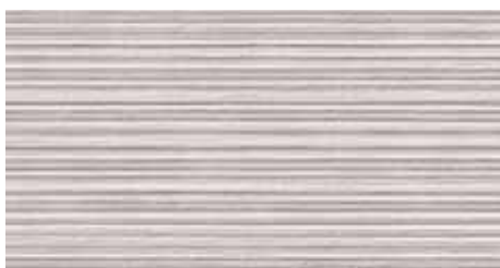
Relieve Concrete beige S 04