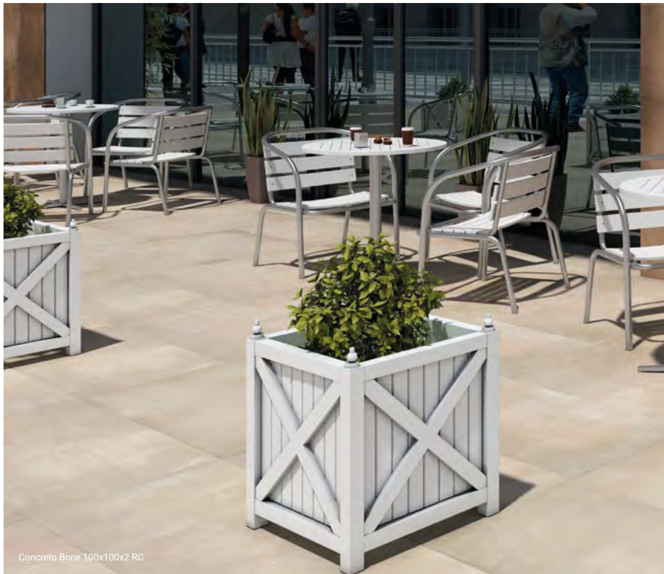
Concreto Bone 100x100x2 RC