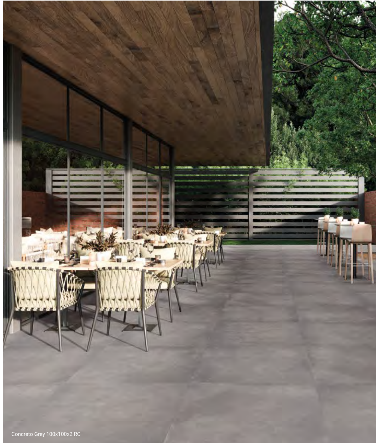
Concreto Grey 100x100x2 RC