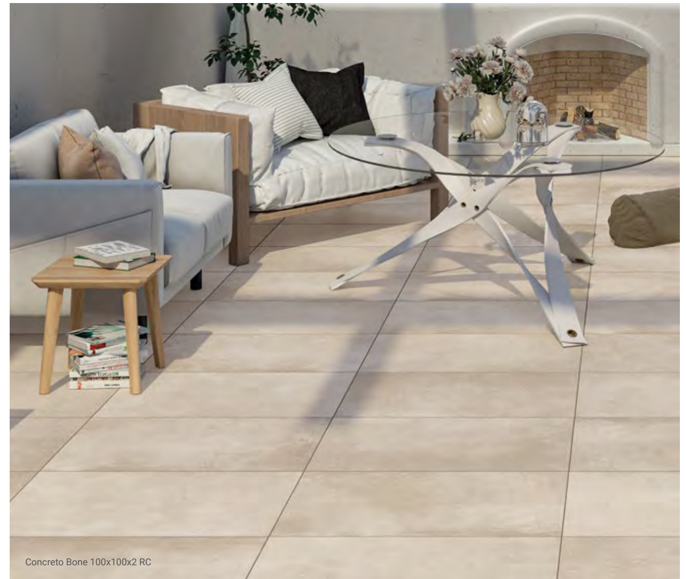
Concreto Bone 100x100x2 RC