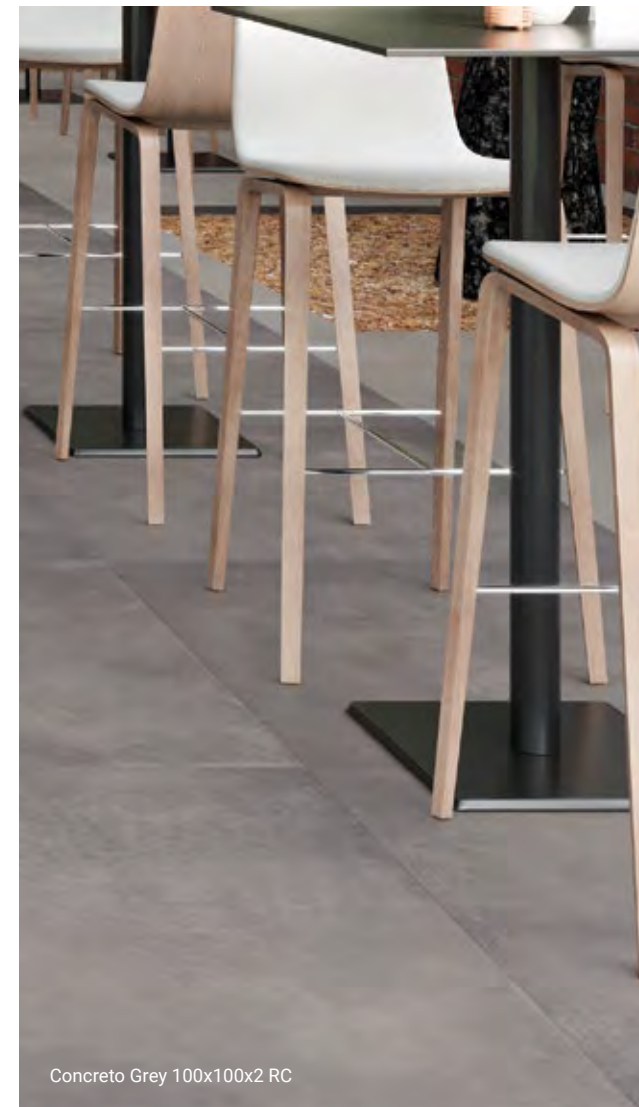
Concreto Grey 100x100x2 RC