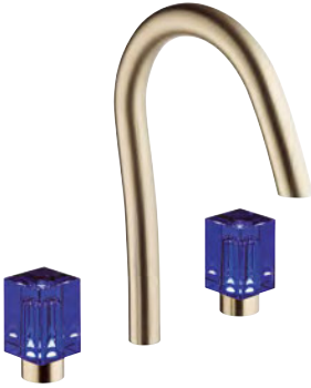
U6K.151 Beyond Crystal - Bleu