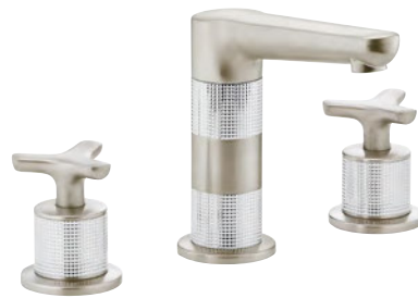
G9C.152 System métal diamant