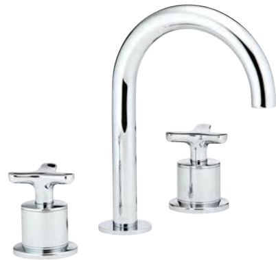
G7F.152 * Bondi