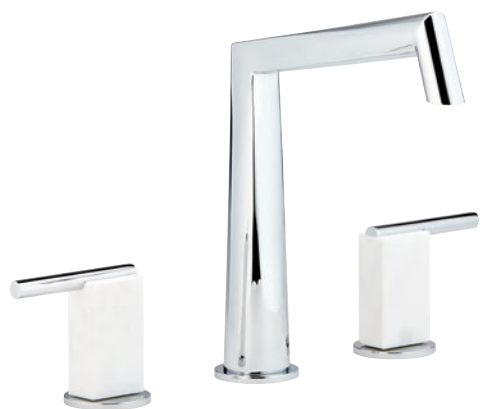
G3W.151 Montaigne - Venus White