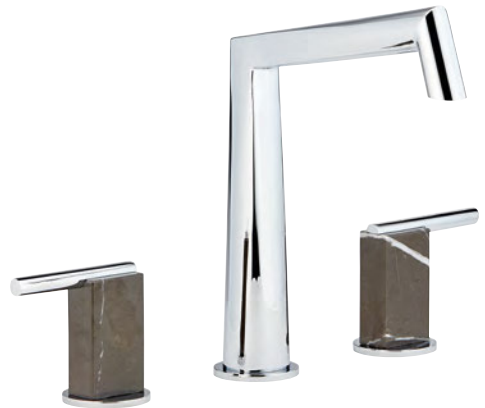
G3U.151 Montaigne - Leonardo Grey