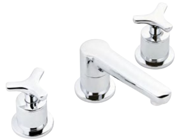
G9A.151 System métal lisse