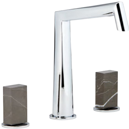
G3T.151 Montaigne - Leonardo Grey