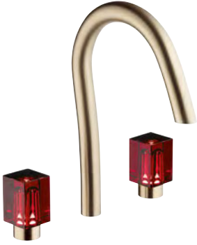
U6H.151 Beyond Crystal - Rouge