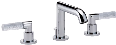
A35.151 Bambou cristal clair, design by Studio THG Paris & Lalique