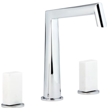
G3V.151 Montaigne - Venus White