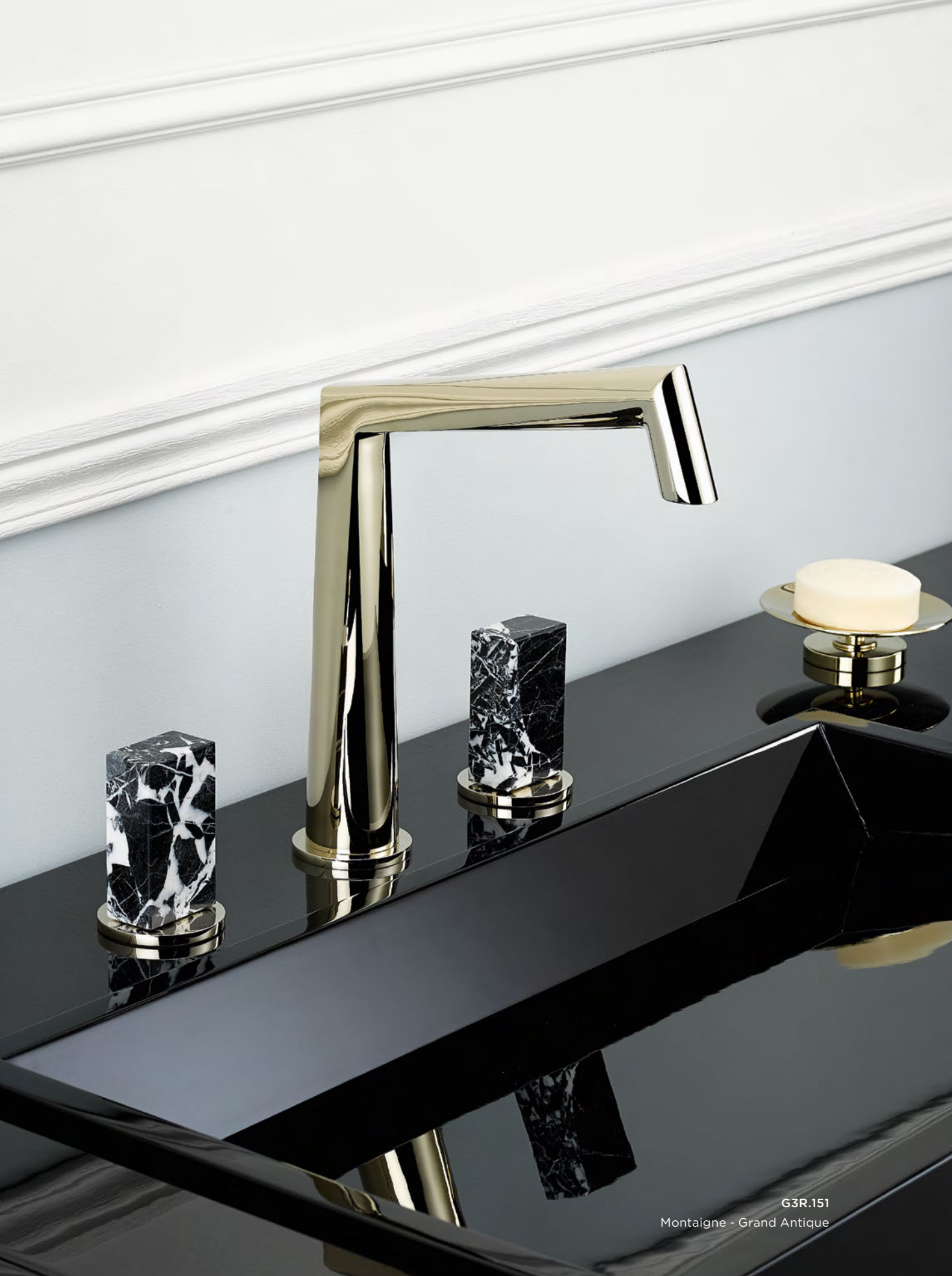
G3R.151 Montaigne - Grand Antique