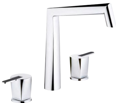
G6C.151 Métamorphose carbone, design by Studio Putman