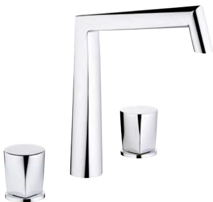
G6A.151 Métamorphose, design by Studio Putman