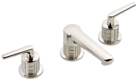
G9F.151 System métal quadrillé