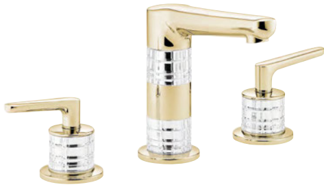
G9K.152 System Cristal