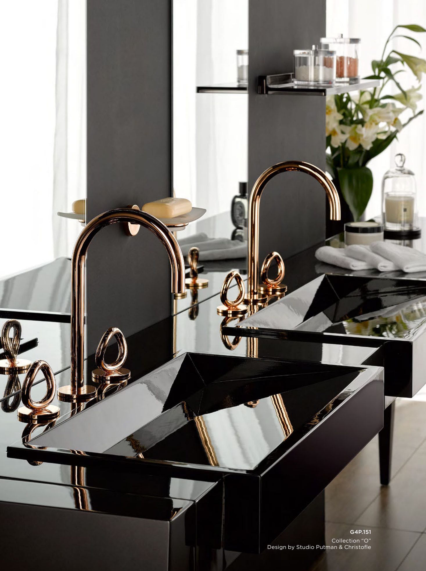
G4P.151 Collection "O" Design by Studio Putman & Christoffe