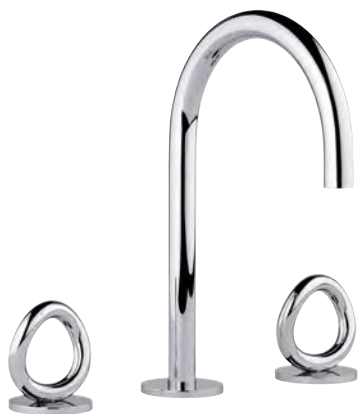
G4P.151 Collection O, design by Studio Putman & Christofle