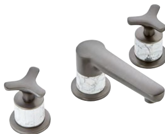
G9G.151 System - Howlite