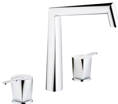
G6B.151 Métamorphose à manettes, design by Studio Putman