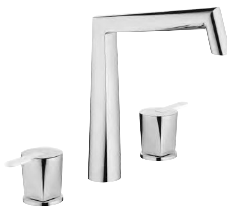
G6E.151 Métamorphose céramique blanche, design by Studio Putman