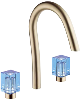
U6G.151 Beyond Crystal - Aqua