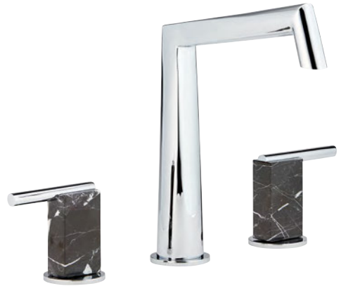
G3S.151 Montaigne - Grand Antique