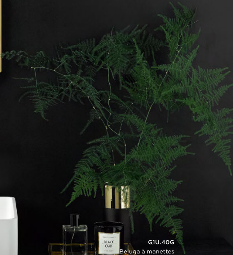
GIU.40G Beluga à manettes