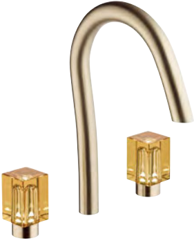
U6J.151 Beyond Crystal - Champagne