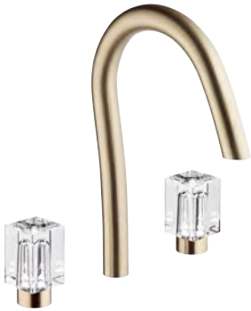
U6F.151 Beyond Crystal - Clair