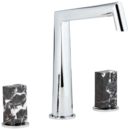
G3R.151 Montaigne - Grand Antique