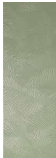
KENTIA GREEN RECT. 31,6X90 / 12,5"X36" T04/M