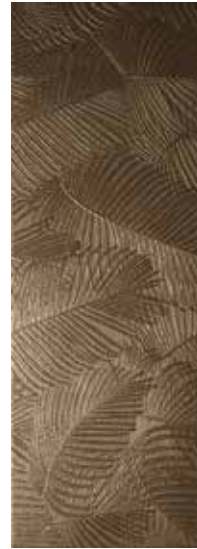
KENTIA BRONZE RECT. 31,6X90 / 12,5"X36" T45/M