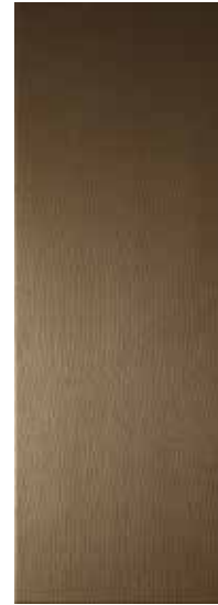
CRAYON BRONZE RECT. 31,6X90 / 12,5"X36" T07/M