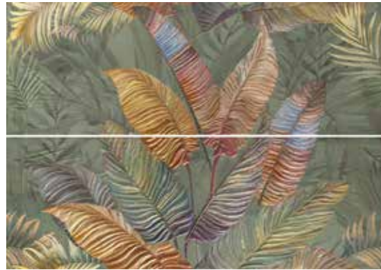
DECOR SET(2) VERGEL 31,6X90 / 12,5"X36" T42/P