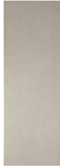
CRAYON SILVER RECT. 31,6X90 / 12,5"X36" T07/M