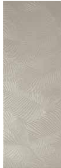
KENTIA SILVER RECT. 31,6X90 / 12,5"X36" T45/M