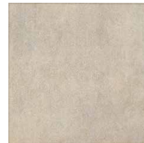
IRIDIUM GRIS 60X60 59X59 REC. LAP. 45X45