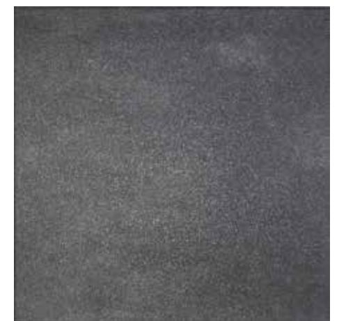
IRIDIUM NEGRO 60X60 59X59 REC. LAP. 45X45