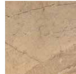
DAINO REAL NOCE 32,5x32,5