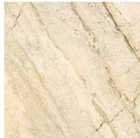
DAINO REAL MARFIL 60x60 59x59 REC. NPLUS