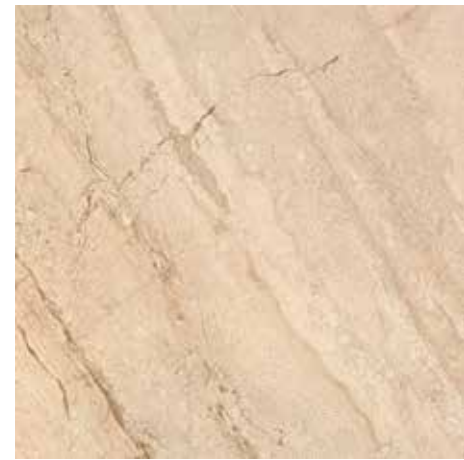
DAINO REAL CREMA 60x60 59x59 REC. NPLUS

60X60 • 59X59 REC. NPLUS • 45X45 • 32,5X32,5