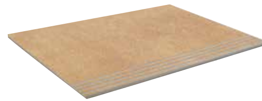
PELDAÑO IRIDIUM BEIGE* 30x60 29x59 REC. LAP.