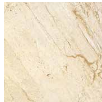
DAINO REAL MARFIL 45x45