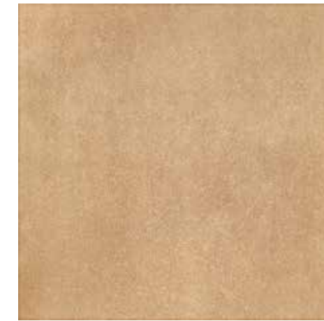
IRIDIUM BEIGE 60X60 59X59 REC. LAP. 45X45