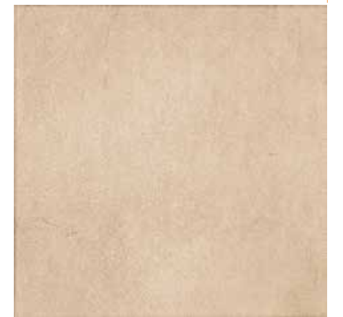
IRIDIUM CREMA 60X60 59X59 REC. LAP. 45X45