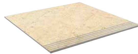
PELDAÑO DAINO MARFIL** 30x60 29x59 REC. PLUS