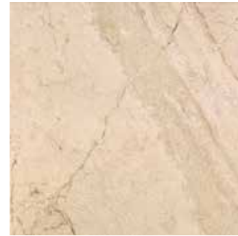
DAINO REAL CREMA 45x45