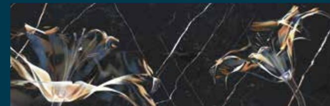
Д 210 082