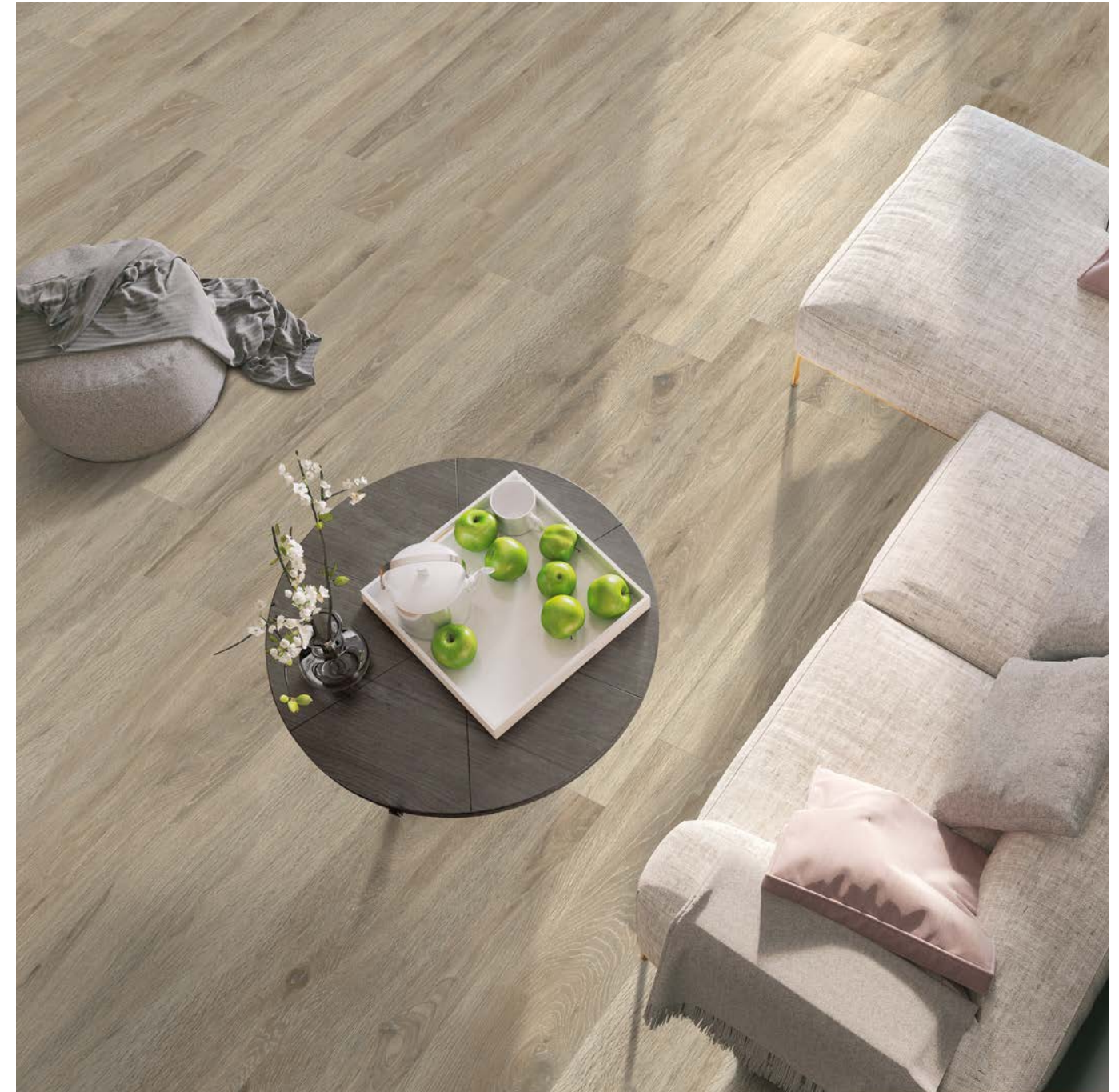
Deck natural 20x120 / 8"x48"