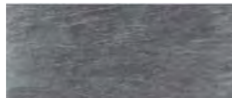
Devon Graphite | W-051