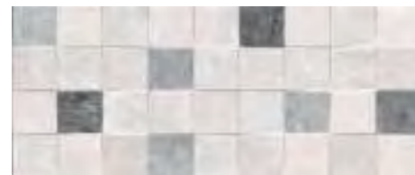
Mosaico Devon | W-051