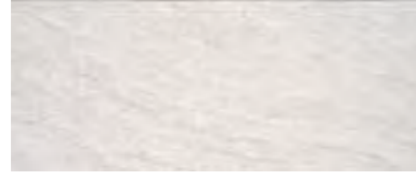
Devon White | W-050