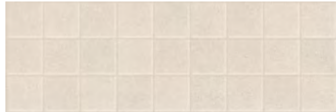
DIMENSION ROUGH CREAM