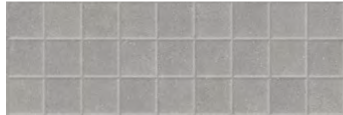
DIMENSION ROUGH GREY