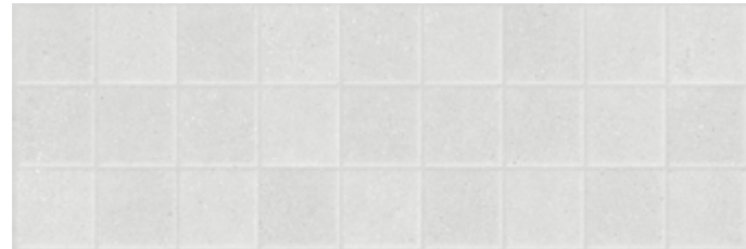
DIMENSION ROUGH LIGHT