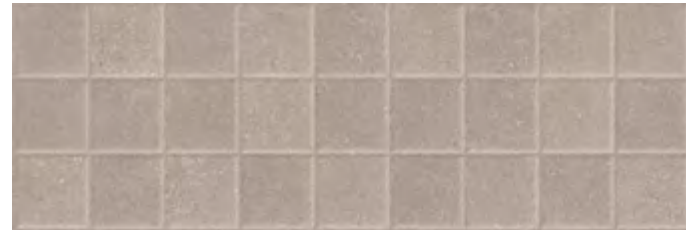
DIMENSION ROUGH TAUPE