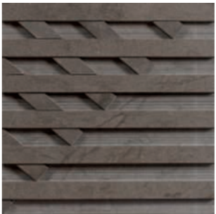
20064 D. ELEUSINE GREY/2 H25 (15x15 cm) (5 15/16x5 15/16")