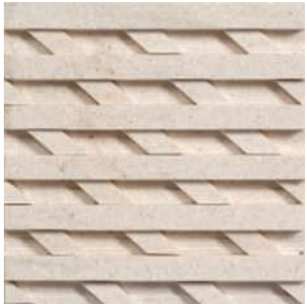
20062 D. ELEUSINE CREAM/3 H25 (15x15 cm) (5 15/16x5 15/16")