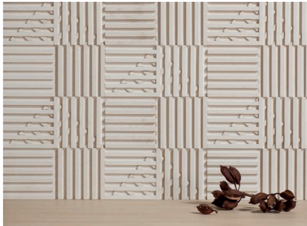
D. ELEUSINE CREAM/1 · D. ELEUSINE CREAM/2 · D. ELEUSINE CREAM/3

'ELEUSINE by JIN KURAMOTO' is a stone-effect collection inspired by the irregularity of typical features of everyday life: the shadows of lines cast by the sun on a wall, a hedge made with the leaves of a plant, the vines that cover a wall, special soil that is created when rock is exposed to wind and rain, the appearance of gradually worn material etc. The Japanese design studio JIN KURAMOTO reconstructed these situations and expressions of everyday life, using straight lines, on tiles designed exclusively for Harmony.