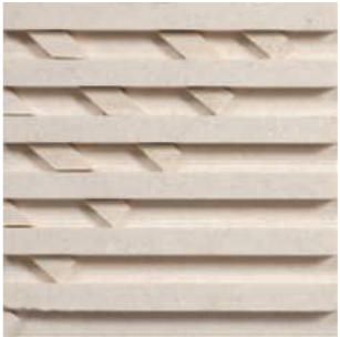
20061 D. ELEUSINE CREAM/2 H24 (15x15 cm) (5 15/16x5 15/16")