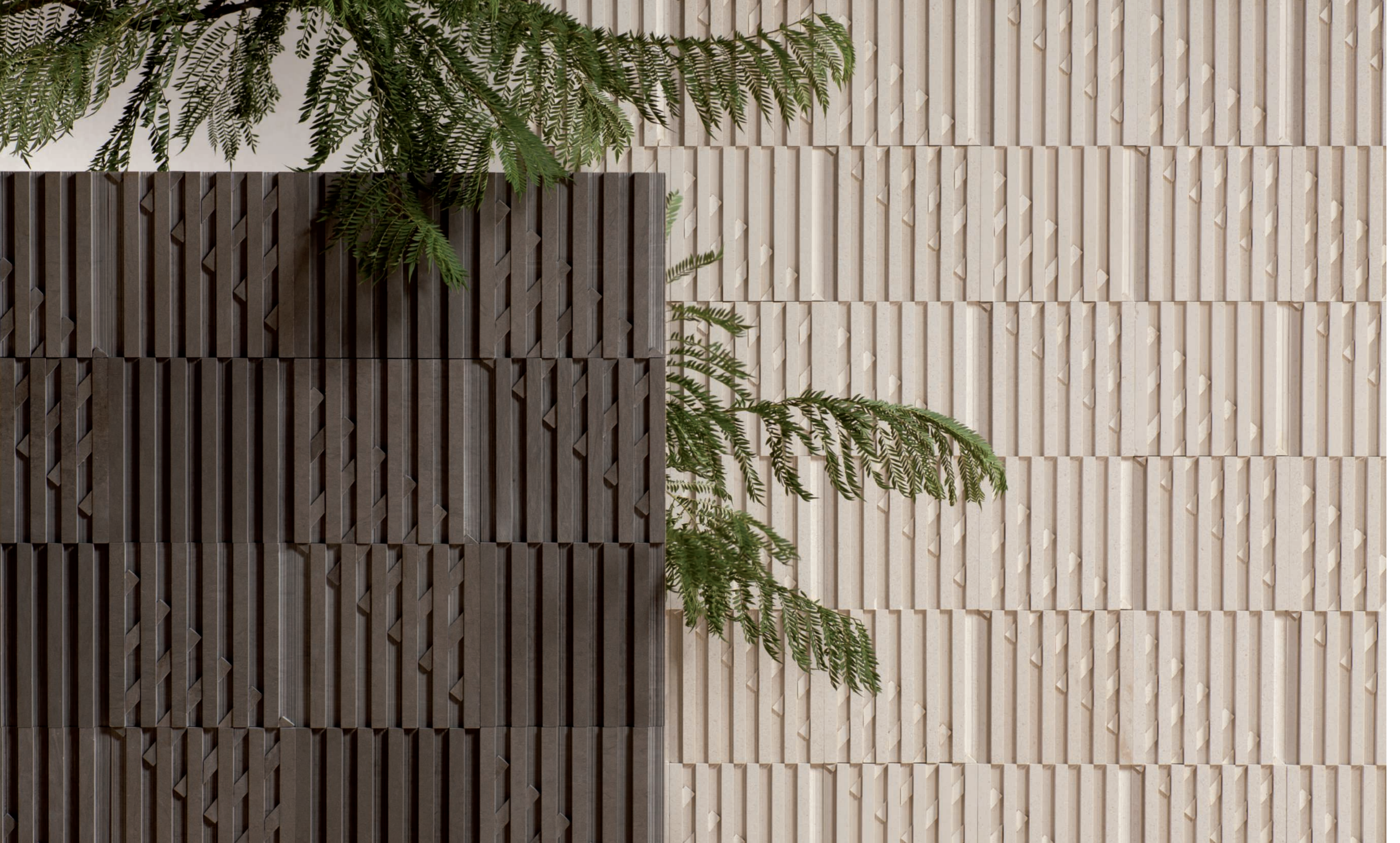
D. ELEUSINE CREAM/1 · D. ELEUSINE CREAM/2 · D. ELEUSINE GREY/1 · D. ELEUSINE GREY/2