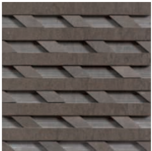
20065 D. ELEUSINE GREY/3 H18 (15x15 cm) (5 15/16x5 15/16")