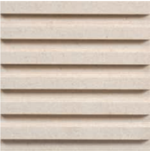
20060 D. ELEUSINE CREAM/1 H22 (15x15 cm) (5 15/16x5 15/16")