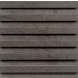
20063 D. ELEUSINE GREY/1 H23 (15x15 cm) (5 15/16x5 15/16")