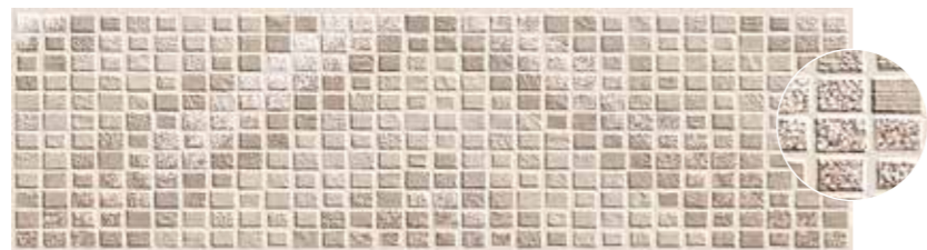
DECOR ACUSTIC SAND 29 X 100 RECT.