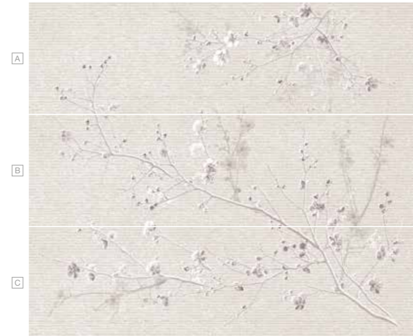
DECOR PEACE WHITE (A) DECOR PEACE WHITE (B) DECOR PEACE WHITE (C) 29 X 100 RECT.