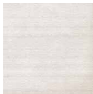
ELEVATION WHITE 60,75 X 60,75