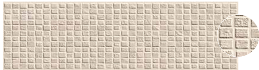
PROJECT SAND 29 X 100 RECT.