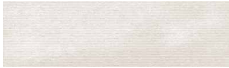
ELEVATION WHITE 29 X 100 RECT.