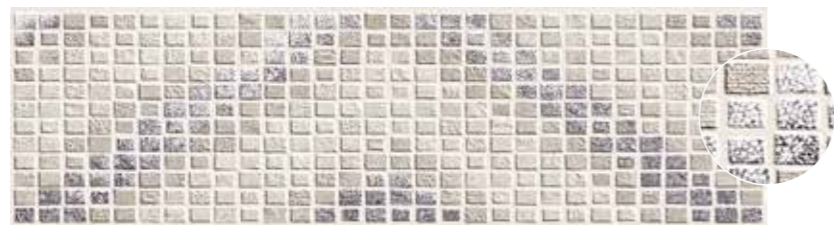
DECOR ACUSTIC WHITE 29 X 100 RECT.