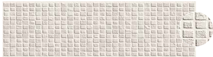
PROJECT WHITE 29 X 100 RECT.