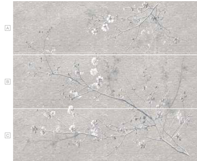
DECOR PEACE GREY (A) DECOR PEACE GREY (B) DECOR PEACE GREY (C) 29 X 100 RECT.