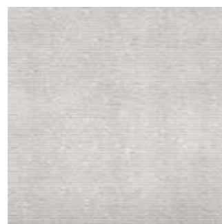
ELEVATION GREY 60,75 X 60,75