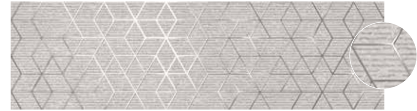
DECOR REVERSE GREY 29 X 100 RECT.