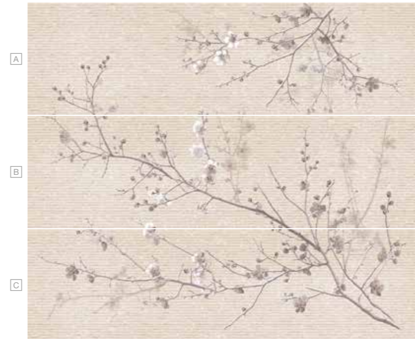
DECOR PEACE SAND (A) DECOR PEACE SAND (B) DECOR PEACE SAND (C) 29 X 100 RECT.