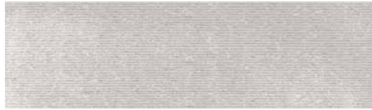
ELEVATION GREY 29 X 100 RECT.