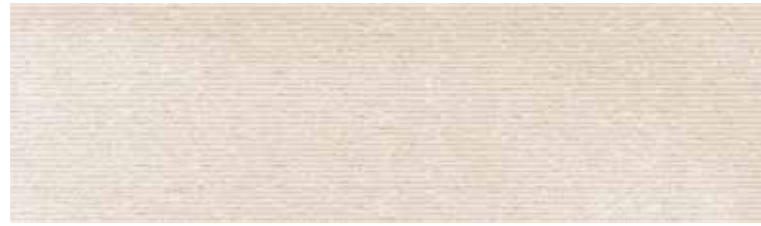
ELEVATION SAND 29 X 100 RECT.