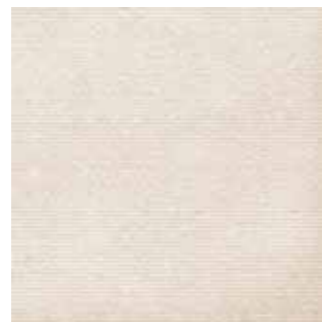
ELEVATION SAND 60,75 X 60,75