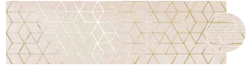
DECOR REVERSE SAND 29 X 100 RECT.