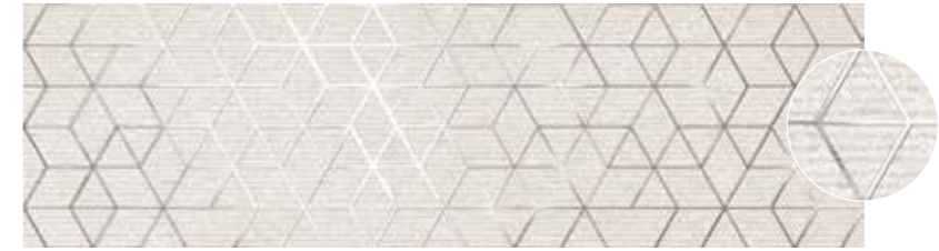
DECOR REVERSE WHITE 29 X 10 RECT.