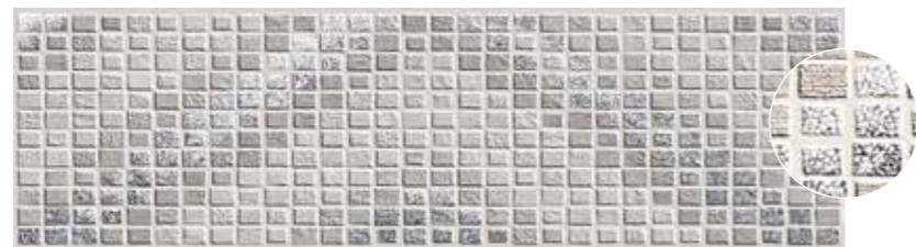
DECOR ACUSTIC GREY 29 X 100 RECT.