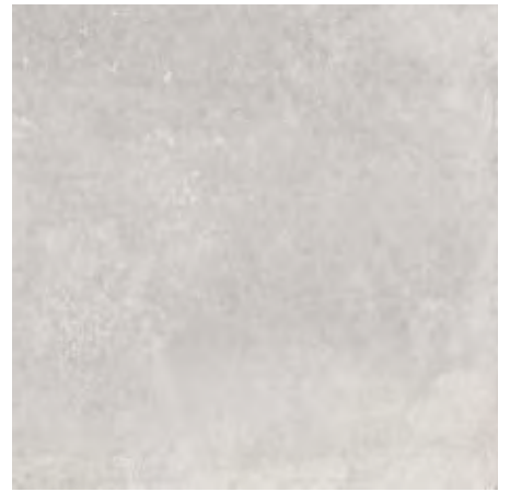
58,5 x 58,5 R 219267 M84