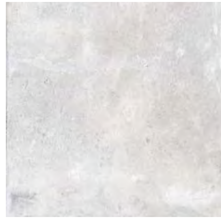
58,5 x 58,5 R 219078 M84