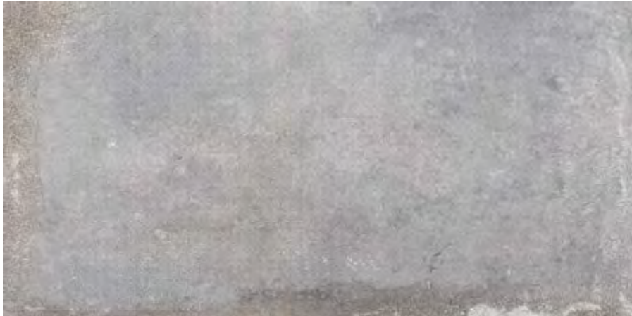
58,5 x 117,2 R 219528 M86