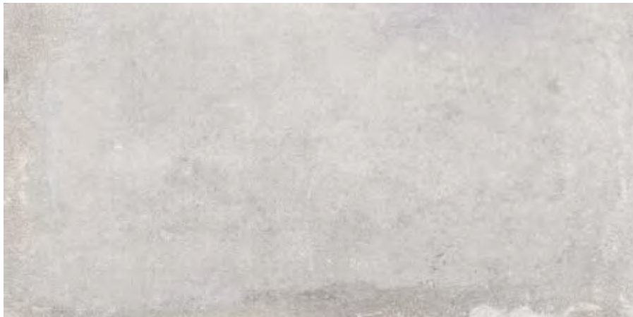
58,5 x 117,2 R 219529 M86