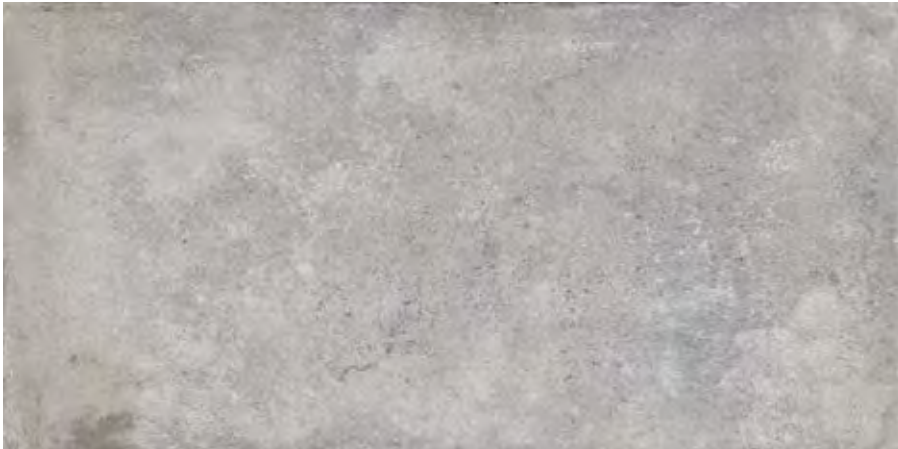
58,5 x 117,2 R 219050 M86