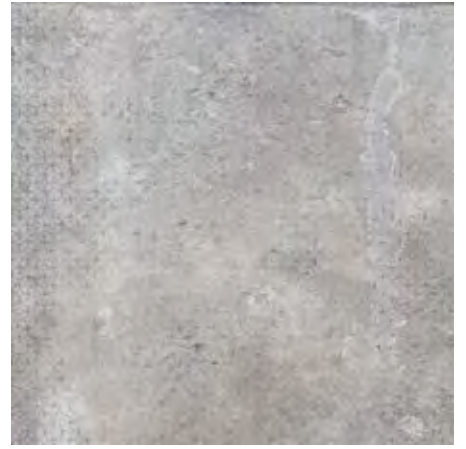
58,5 x 58,5 R 219266 M84