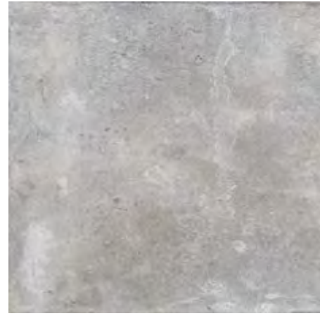
58,5 x 58,5 R 219077 M84