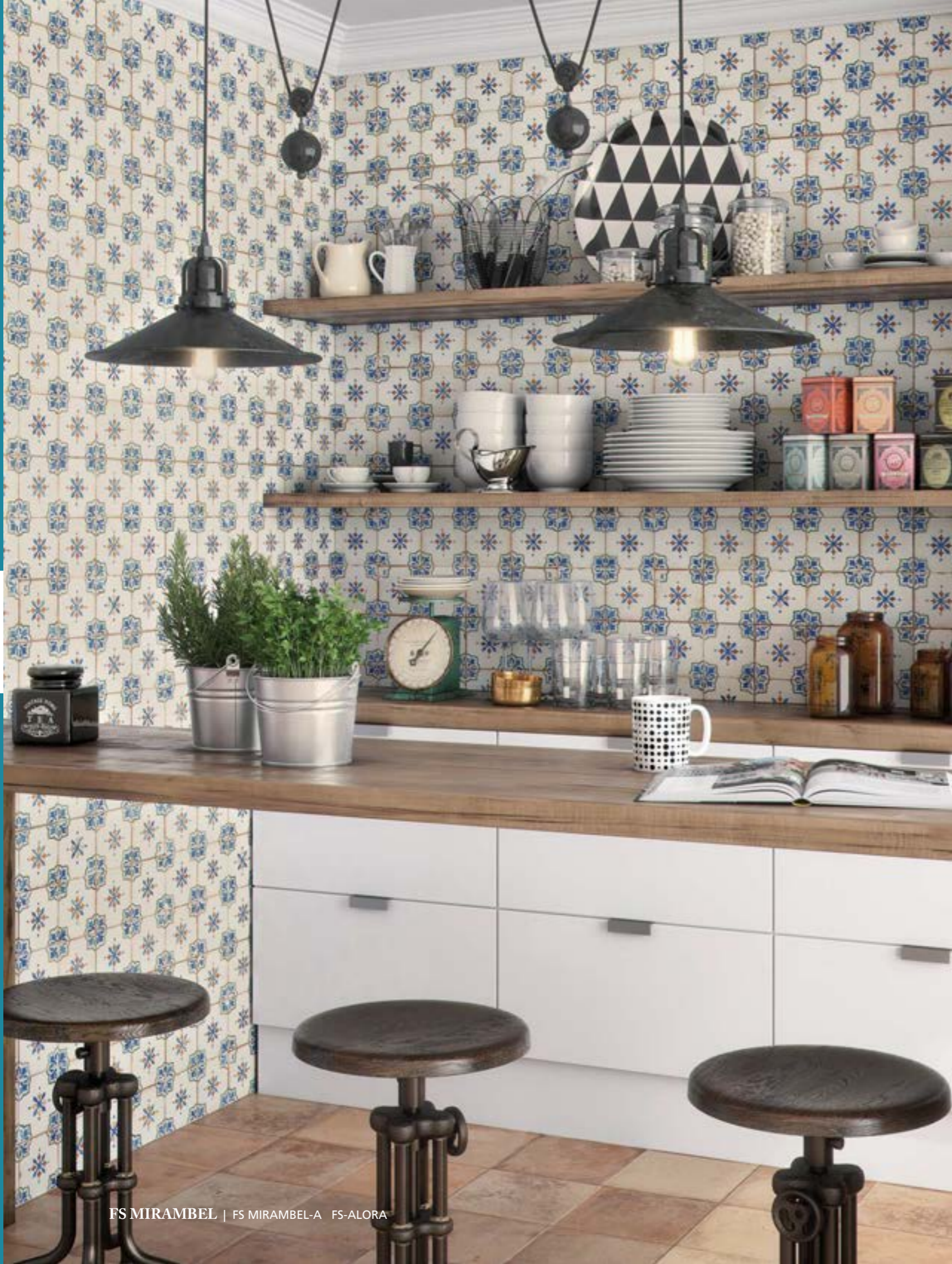
FS MIRAMBEL | FS MIRAMBEL-A FS-ALORA