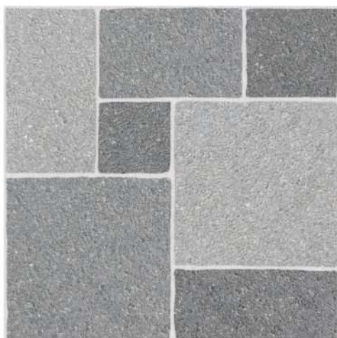
DK Grava Mix