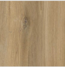
LIGHT BROWN GR5