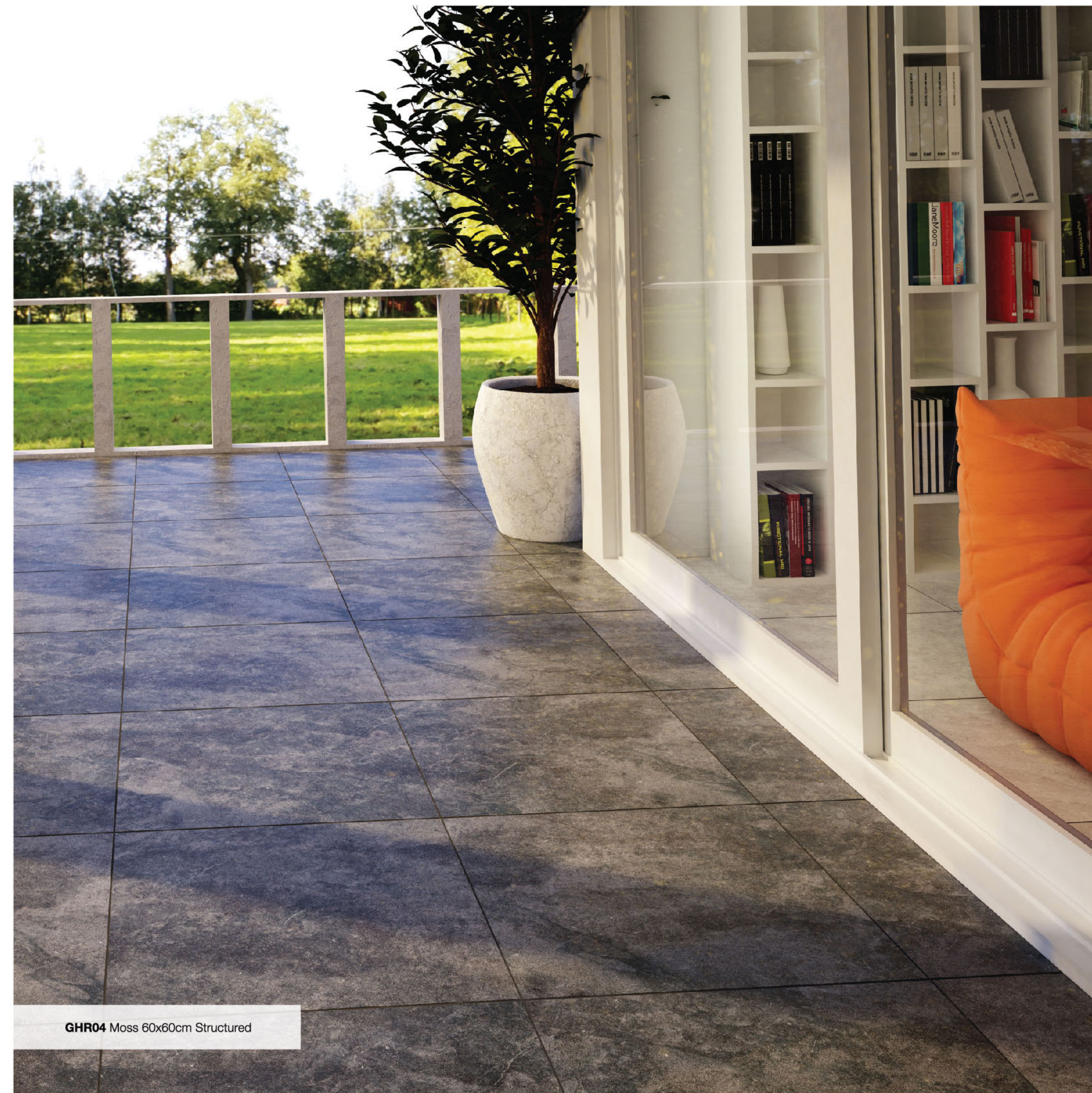
GHR04 Moss 60x60cm Structured