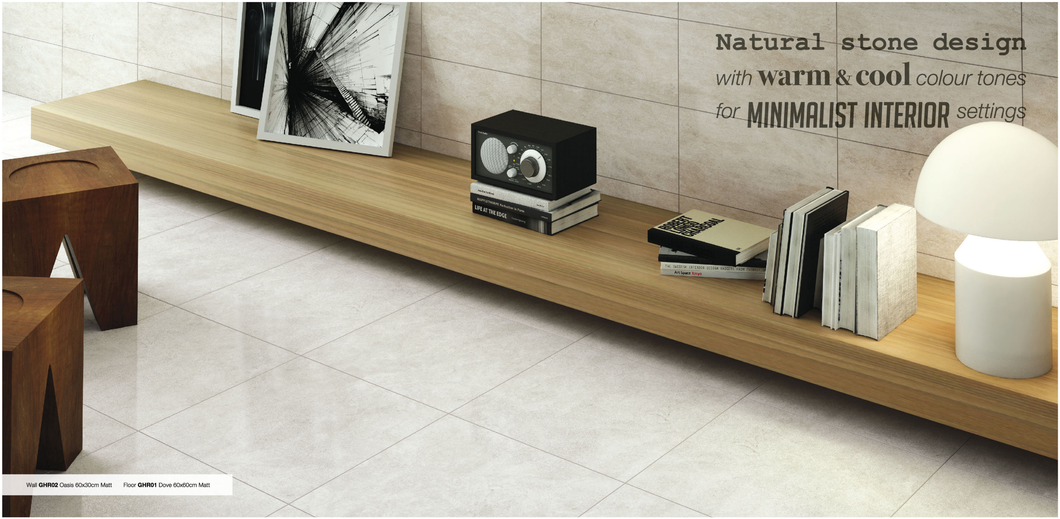
Wall GHR02 Oasis 60x30cm Matt Floor GHR01 Dove 60x60cm Matt

Natural stone design with warm & cool colour tones for MINIMALIST INTERIOR settings