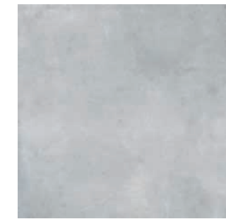
25373 BAYAMO GREY/22,3 Q6 (22,3x22,3 cm) (8 3/4 x 8 3/4") 5 patterns