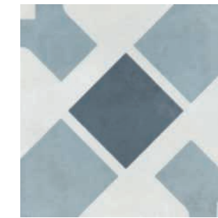
24764 HAVANA WHITE CROSS/22,3 Q6 (22,3x22,3 cm) (8 3/4 x 8 3/4") 5 patterns