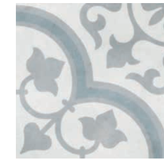
24763 HAVANA SILVER ORNATE/22,3 Q6 (22,3x22,3 cm) (8 3/4 x 8 3/4") 5 patterns