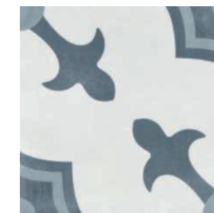
24769 HAVANA WHITE HERALD/22,3 Q6 (22,3x22,3 cm) (8 3/4 x 8 3/4") 5 patterns