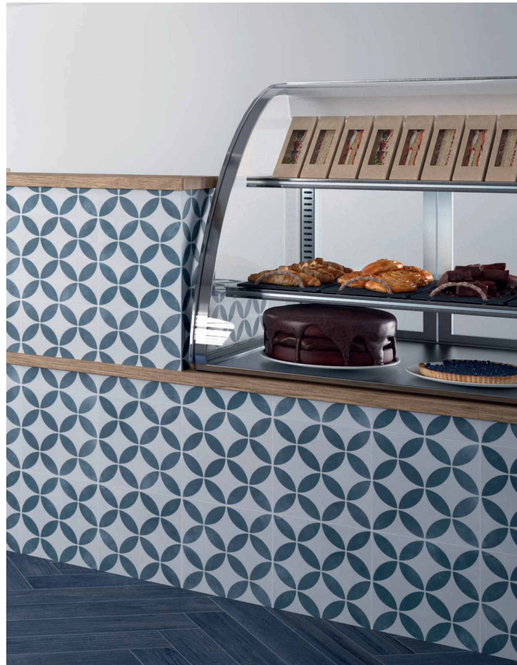
HAVANA WHITE PETALS/22,3

Esta nueva colección de inspiración hidráulica toma su nombre de la capital cubana donde esta tipología de producto decora tradicionalmente muchos de sus interiores. HAVANA, en formato 22,3x 22,3 cm, trabaja la gama cromática de blancos, grises, azules y verdes destonificados en formas geométricas u ornamentales que permiten realizar composiciones en continuidad. Una nueva visión de la tendencia hidráulica con todo lujo de detalles.