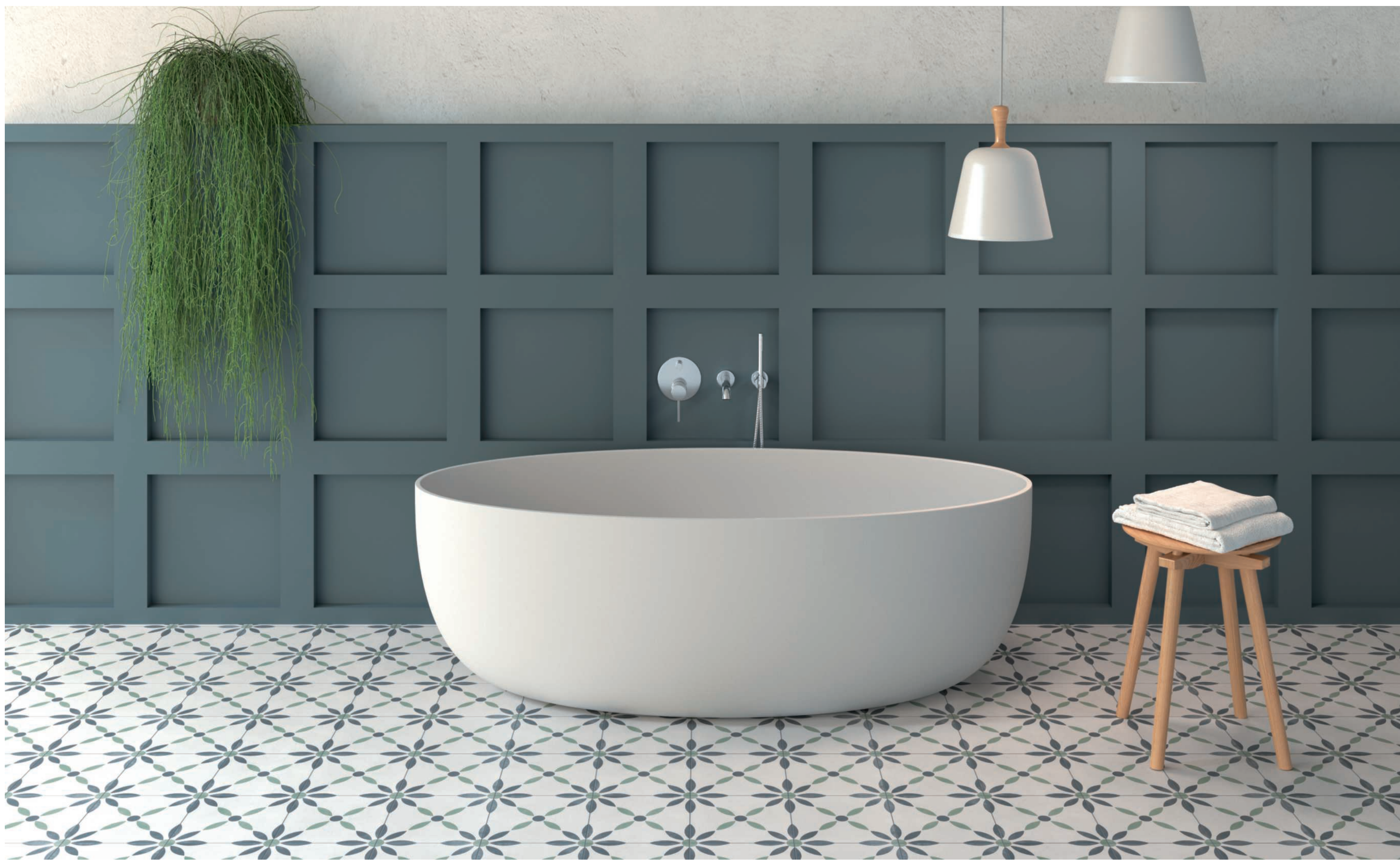
HAVANA WHITE FLOWER/22,3