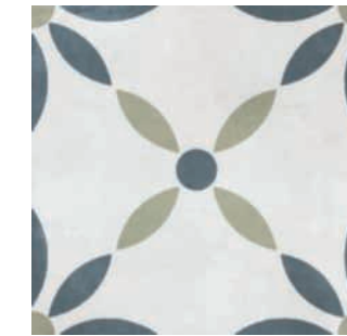
24768 HAVANA WHITE FLOWER/22,3 Q6 (22,3x22,3 cm) (8 3/4 x 8 3/4") 5 patterns