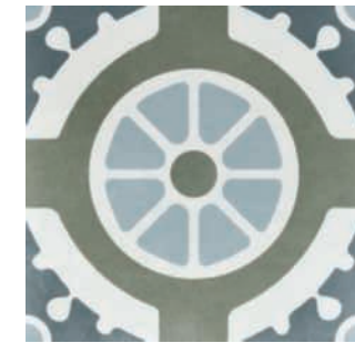
24766 HAVANA WHITE ROUND/22,3 Q6 (22,3x22,3 cm) (8 3/4 x 8 3/4") 5 patterns