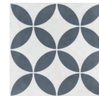
24765 HAVANA WHITE PETALS/22,3 Q6 (22,3x22,3 cm) (8 3/4 x 8 3/4") 5 patterns