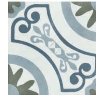
24767 HAVANA WHITE GARDEN/22,3 Q6 (22,3x22,3 cm) (8 3/4 x 8 3/4") 5 patterns