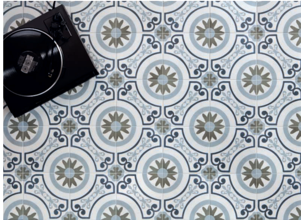
HAVANA WHITE GARDEN/22,3

This new collection, inspired by traditional cement tiles, takes its name from the capital of the island of Cuba, where these tiles were traditionally used in many buildings. HAVANA comes in a 22.3x22.3cm format in different shades of white, grey, blue and green, with geometrical shapes or other motifs that can be combined to create continuous patterns. A new vision of cement tiles, with a myriad of subtle nuances.