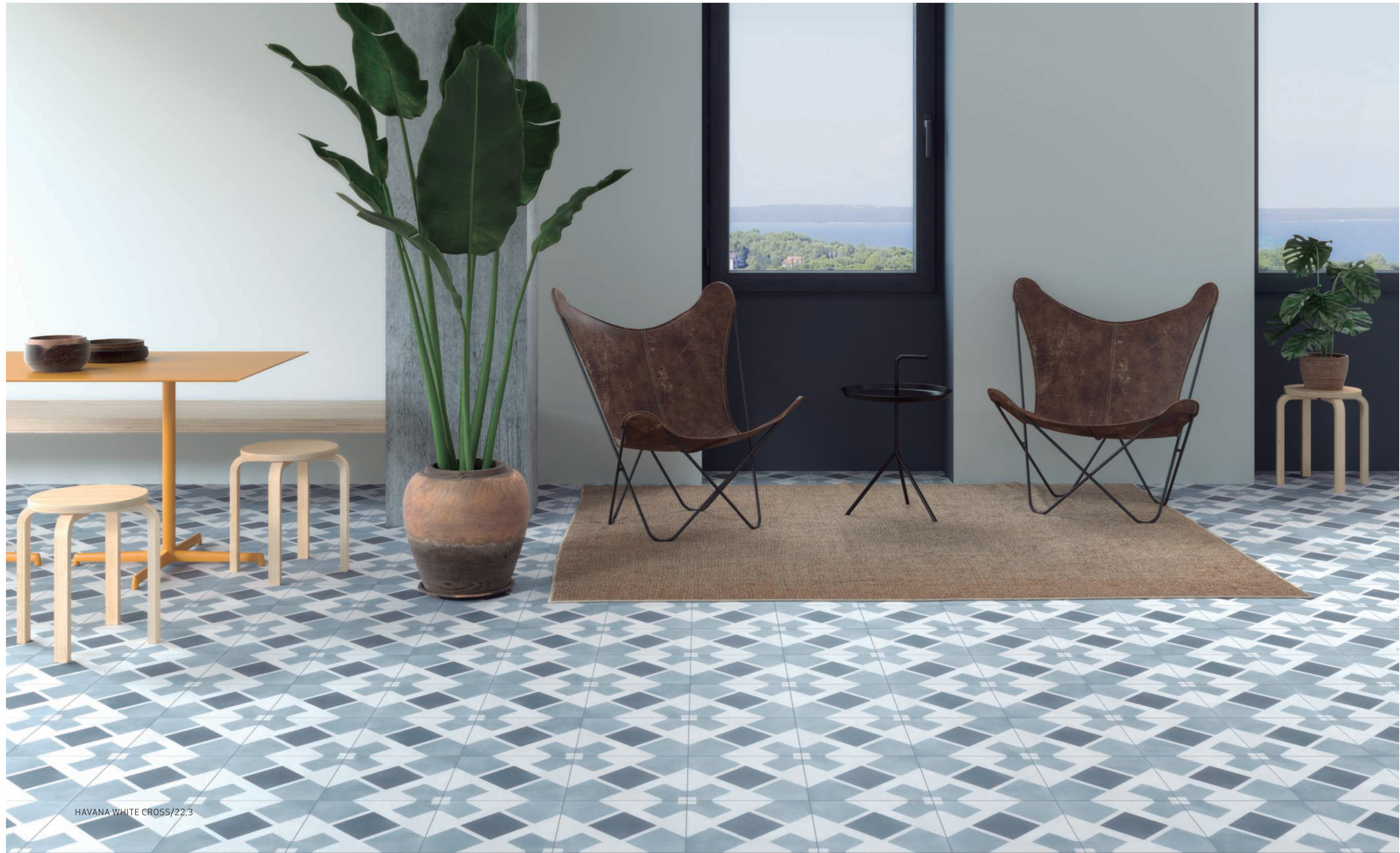
HAVANA WHITE CROSS/22,3