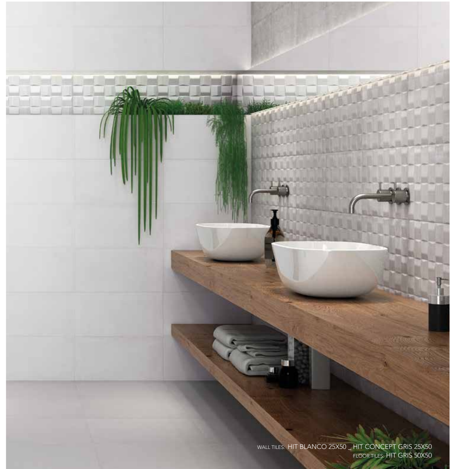
WALL TILES: HIT BLANCO 25X50 _ HIT CONCEPT GRIS 25X50 FLOOR TILES: HIT GRIS 50X50

S150 GRIS GSQVP002 GRAFITO GSQVP00J BEIGE GSQVP00I VISON GTJVP00C