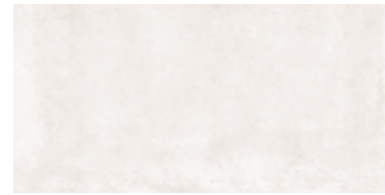
HIT CREMA 25 X 50 KTJTP001 R25D 15