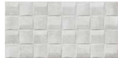
HIT CONCEPT GRIS 25 X 50 KTJTP012 R25G 3