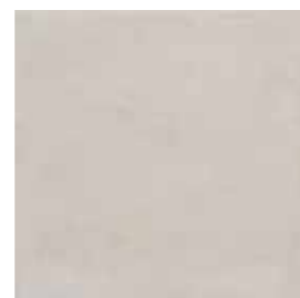
HIT VISON 50X50 GTJ1300C P50D 18