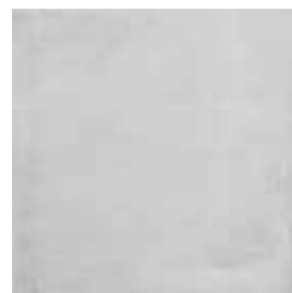
HIT GRIS 50X50 GSQ13002 P50D 18