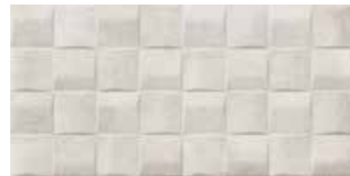
HIT CONCEPT VISON 25 X 50 KTJTP01C R25G 3