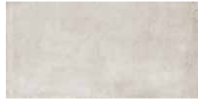
HIT VISON 25 X 50 KTJTP00C R25D 15