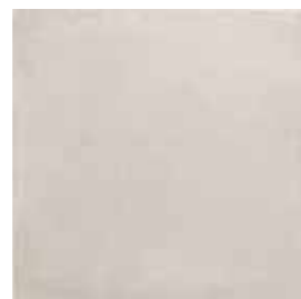
HIT BEIGE 50X50 GSQ1300I P50D 18