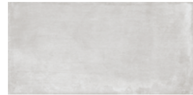
HIT GRIS 25 X 50 KTJTP002 R25D 15