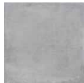
HIT GRAFITO 50X50 GSQ1300J P50D 18