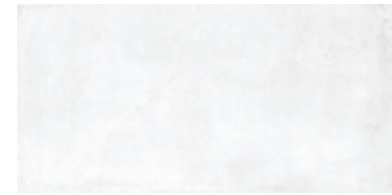
HIT BLANCO 25 X 50 KTJTP000 R25D 15

WHITE BODY WALL TILES / REVESTIMIENTO PASTA BLANCA / FAÏENCE PÂTE BLANCHE / WEISSSCHERBIGE WANDFLIESEN