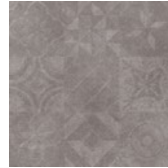
HYDRAULIK GRIS (b)