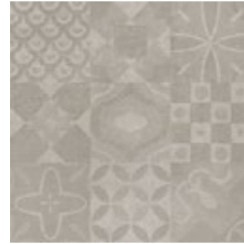
HYDRAULIK FOG (b)