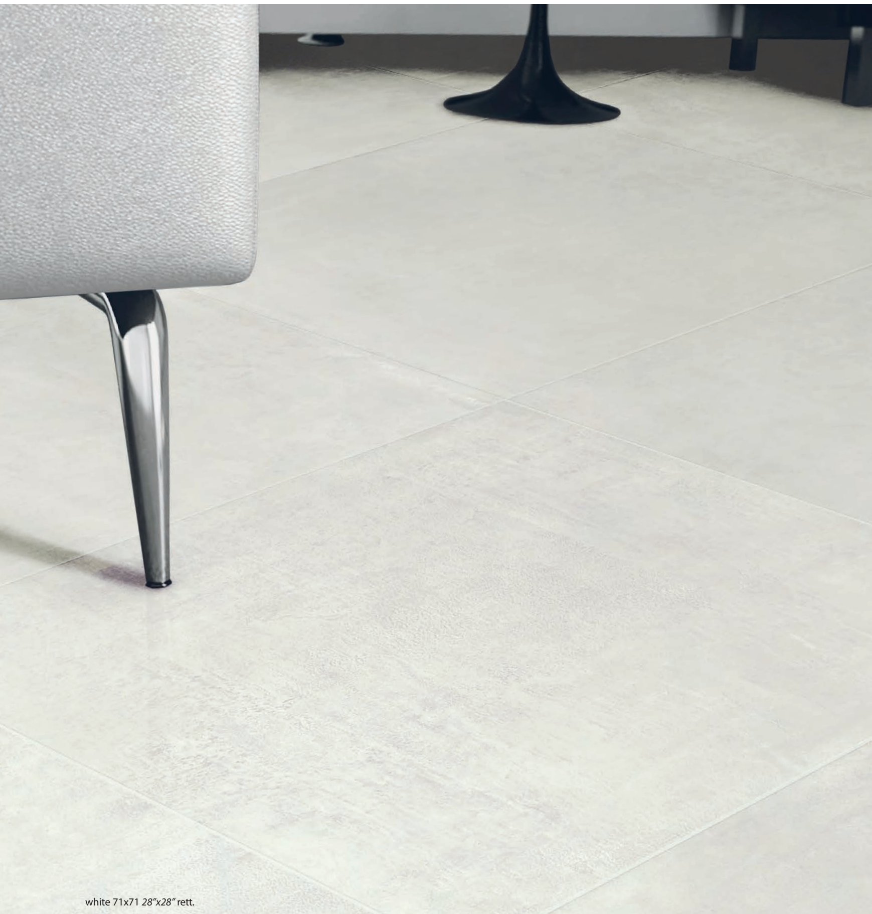
white 71x71 28"x28" rett.