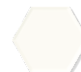
UNIVERSAL HEXAGON WHITE STRUCTURE GLOSSY 17,1×19,8