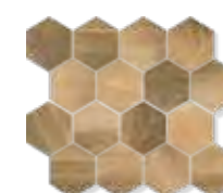
UNIVERSAL PRESSED MOSAIC WOOD NATURAL MIX HEXAGON MATT 22×25,5