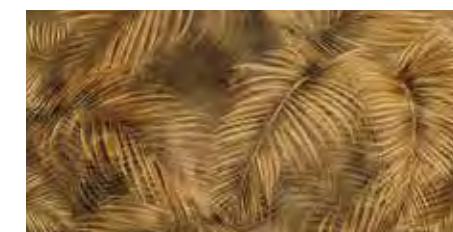
UNIVERSAL GLASS PANEL IDEAL 2x30x60