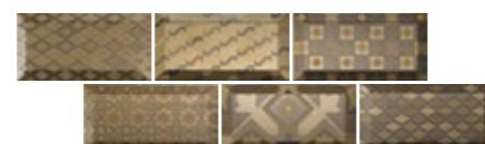
ISTANBUL GOLD 7,5x15 cm. · 3"x6" CK-38