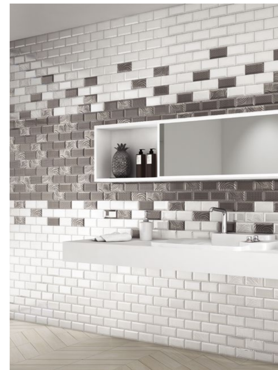
Istanbul White Luster 7,5x15 cm. · 3"x6" · Istanbul Steel 7,5x15 cm. · 3"x6" Pav. Diamond Timber Ash Chevron (L) y (R) 70x40 cm. · 27,5" x 16"

+ DE 36 DISEÑOS DIFERENTES + 36 DIFFERENT DESIGN