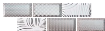
ISTANBUL WHITE METAL 7,5x15 cm. · 3"x6" CK-38