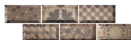
ISTANBUL BRONZE 7,5x15 cm. · 3"x6" CK-38