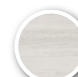
Diamond Timber Ash Pág. 24-29