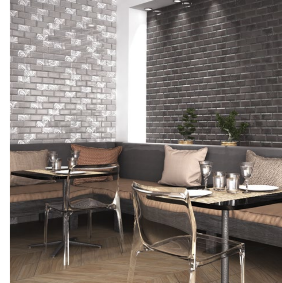
Istanbul Anthracite 7,5x15 cm. · 3"x6" · Istanbul White Metal 7,5x15 cm. · 3"x6" Pav. Diamond Timber Walnut Chevron (L) y (R) 70x40 cm. · 27,5"x16"