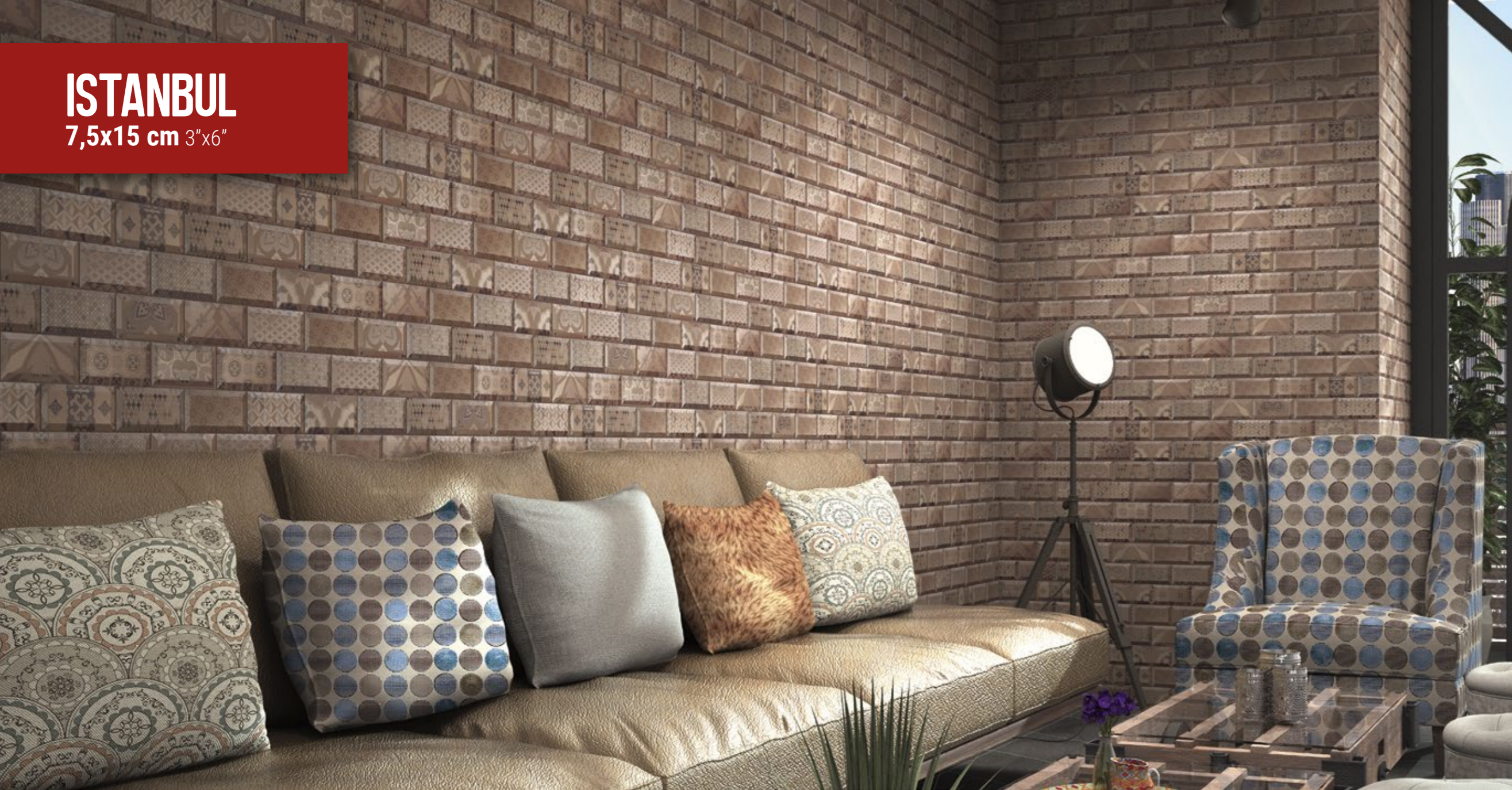
Istanbul Bronze 7,5x15 cm. · 3"x6"