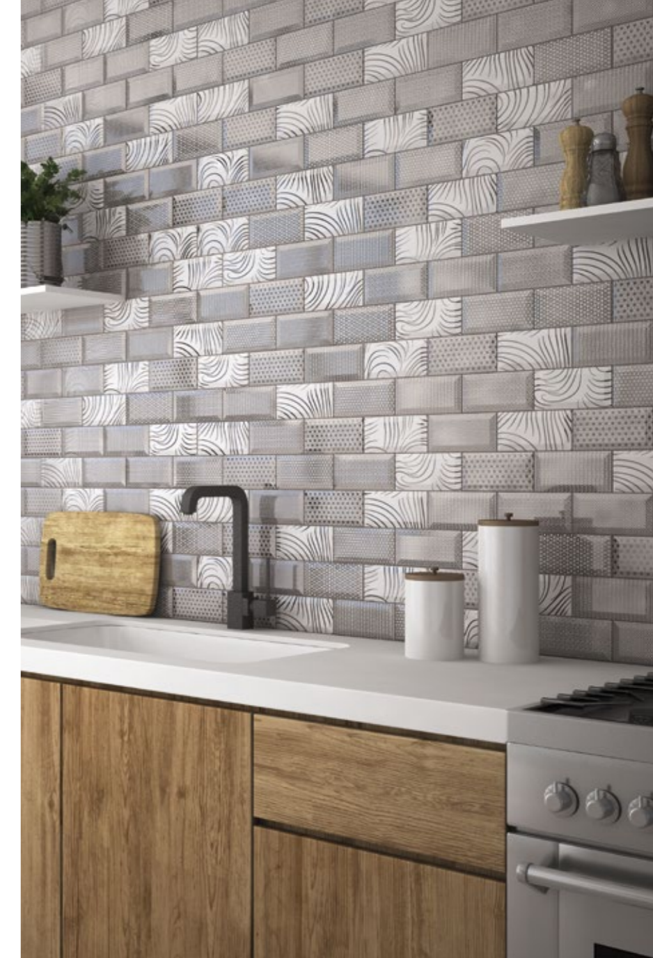
Istanbul White Metal 7,5x15 cm. · 3"x6"