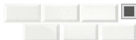
ISTANBUL WHITE LUSTER 7,5x15 cm. · 3"x6" CK-38

Istanbul Gold 7,5x15 cm. · 3"x6" · Istanbul Silver 7,5x15 cm. · 3"x6" Pav. Diamond Timber Oak Chevron (L) y (R) 70x40 cm. · 27,5"x16"