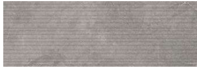
JAZZ LINE GRAFITO 30x90 cm. M 11,81"x35,43" RECTIFIED