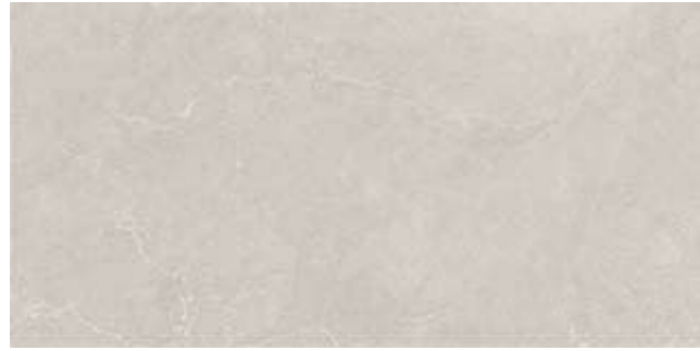
JAZZ PERLA 60x120 cm R55 MATE RECTIFIED

PORCELAIN TILE 3 COLORS_ PERLA / GRIS / GRAFITO 3 SIZES_ 23,62"x47,24" RECTIFIED(60x120cm)/MATT 23,43"x23,43" RECTIFIED(59,5x59,5cm)/MATT 11,61"x23,43" RECTIFIED(29,5x59,5cm)/MATT MESH_ 11,81"x11,81"(30X30cm)/MATT