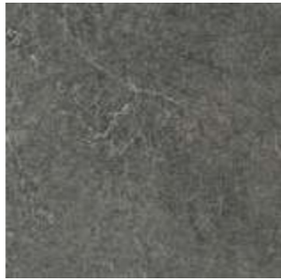
JAZZ GRAFITO 59,5x59,5 cm R54 MATE RECTIFIED