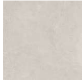
JAZZ PERLA 59,5x59,5 cm R54 MATE RECTIFIED