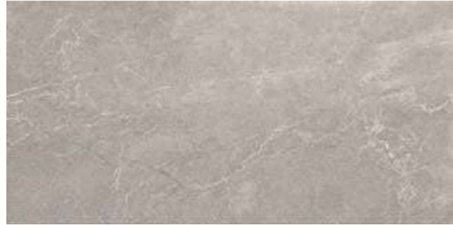
JAZZ GRIS 60x120 cm R55 MATE RECTIFIED