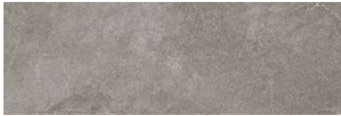
JAZZ GRAFITO 30x90 cm. M 11,81"x35,43" RECTIFIED