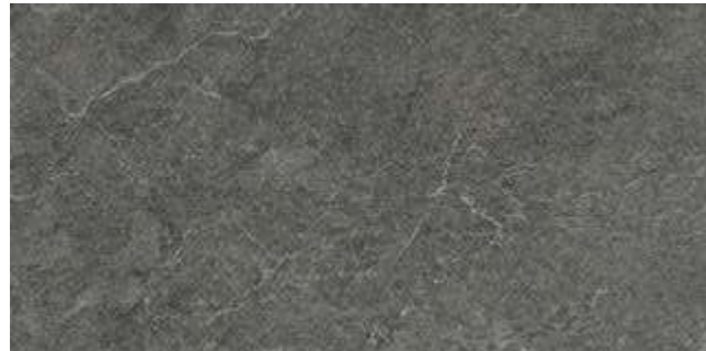
JAZZ GRAFITO 60x120 cm R55 MATE RECTIFIED