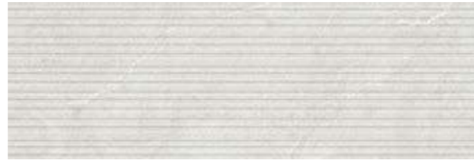
JAZZ LINE PERLA 30x90 cm. M 11,81"x35,43" RECTIFIED