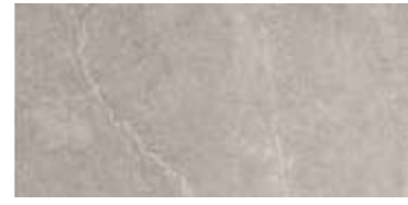
JAZZ GRIS 29,5x59,5 cm R54 MATE RECTIFIED