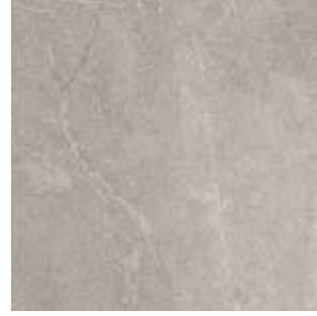
JAZZ GRIS 59,5x59,5 cm R54 MATE RECTIFIED