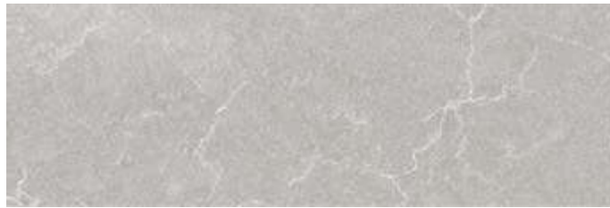
JAZZ GRIS 30x90 cm. M 11,81"x35,43" RECTIFIED