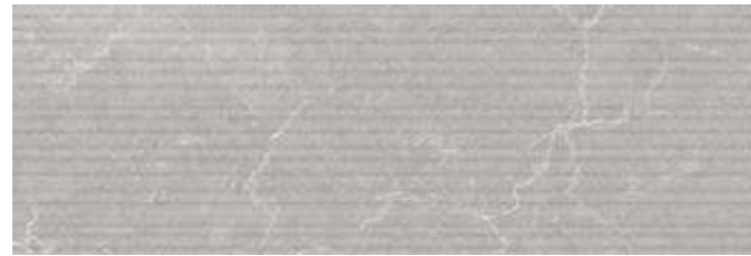
JAZZ LINE GRIS 30x90 cm. M 11,81"x35,43" RECTIFIED