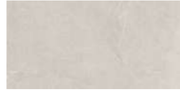
JAZZ PERLA 29,5x59,5 cm R54 MATE RECTIFIED