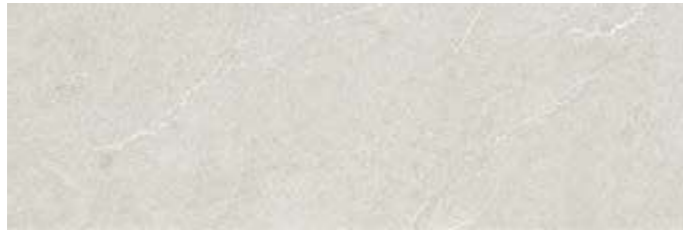
JAZZ PERLA 30x90 cm. M 11,81"x35,43" RECTIFIED