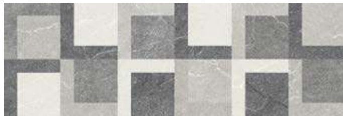
DECOR JAZZ 30x90 cm. M 11,81"x35,43" RECTIFIED