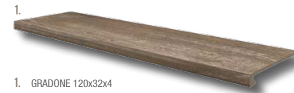
1. GRADONE 120x32x4