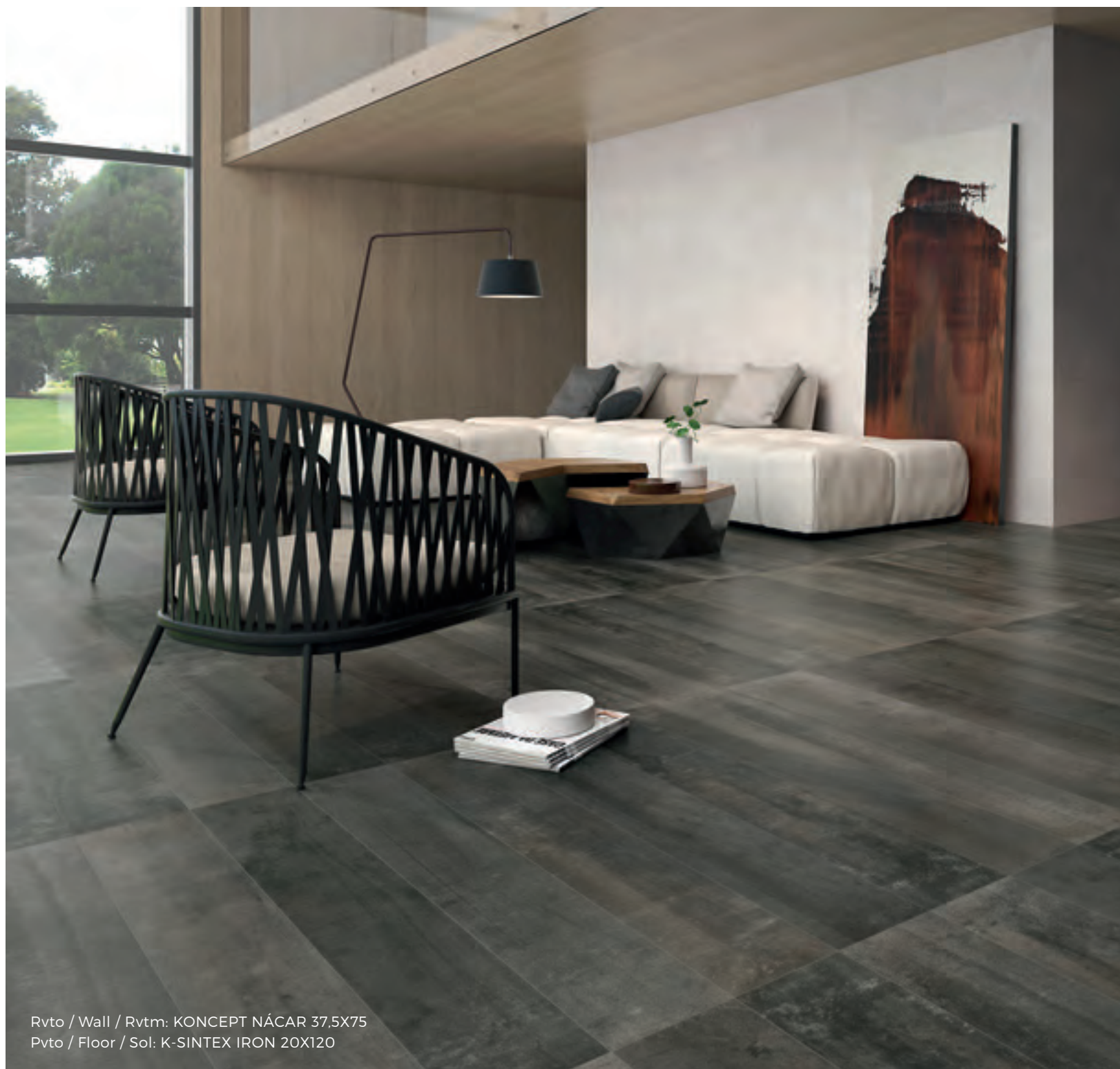
Rvto / Wall / Rvtm: KONCEPT NÁCAR 37.5X75 Pvto / Floor / Sol: K-SINTEX IRON 20X120